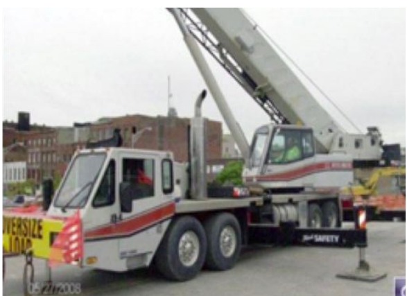
Level 5 Additional Week Mobile Hydraiulic Swing-Cab Crane Crane Operator - Oiler