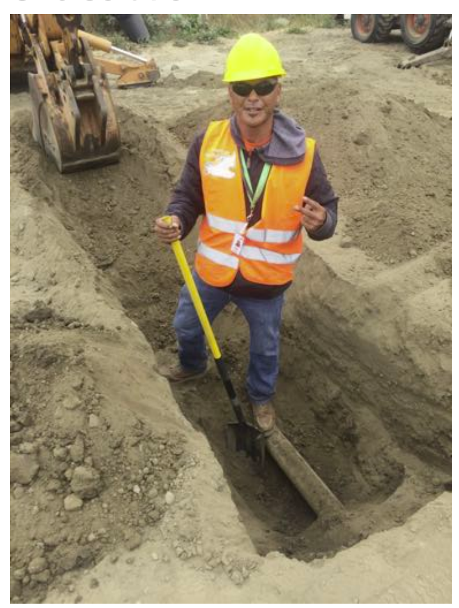
CIT student trenching, locating the pipe, and checking for appropriate shoring.