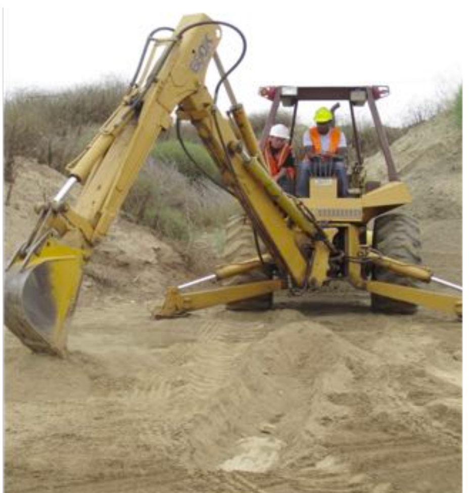
At CIT, students receive plenty of one-on-one instructor assistance during training!

CIT has had over an 85% school-wide job placement rate for over 15 years; CIT implements a very strategic curriculum, which enables students to timely gain the skillset they need to obtain a lifelong career.