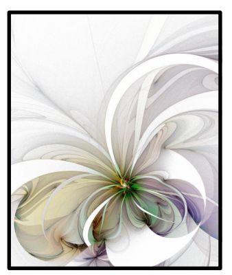
January 2017-January 2019 Catalog

The College of Botanical Healing Arts offers a comprehensive 456-hour certification program in Essential Oil Therapy, enabling one to create a vibrant practice in essential oil therapy and herbal healing. COBHAisa501(c)(3)Non-Profit, the institution is a private institution, that it is approved to operate by the bureau, and that approval to operate means compliance with state standards as set forthinthe CEC and 5, CCR. An institution may not imply that the Bureau endorses programs, or that Bureau approval means the institution exceeds minimum state standards.