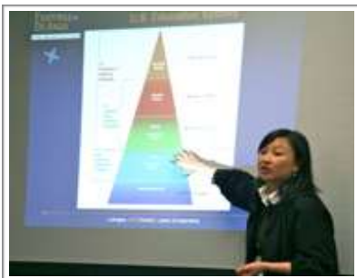
De Anza/Foothill College Visits AAE