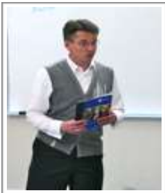
College of San Mateo Visits AAE

Representatives from local colleges and universities regularly visit the Academy to inform our students of what university programs they can pursue after finishing their English studies. Here, representatives from De Anza College , Foothill College , the College of San Mateo , and Notre Dame de Namur University address our student body.