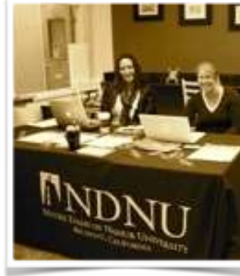
Notre Dame de Namur University Visits AAE