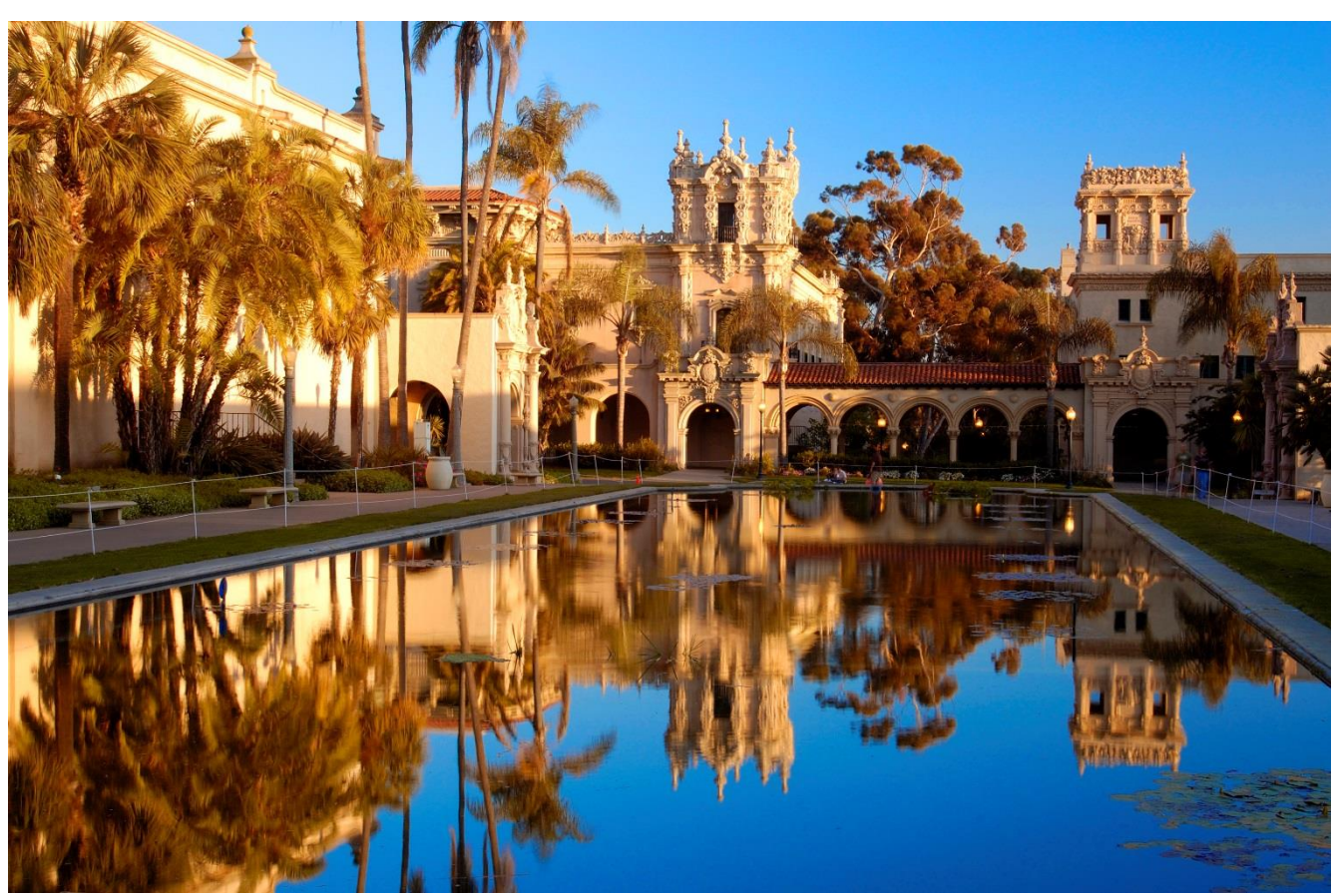
Casa de Balboa, Balboa Park, San Diego, just three miles from the CMU campus