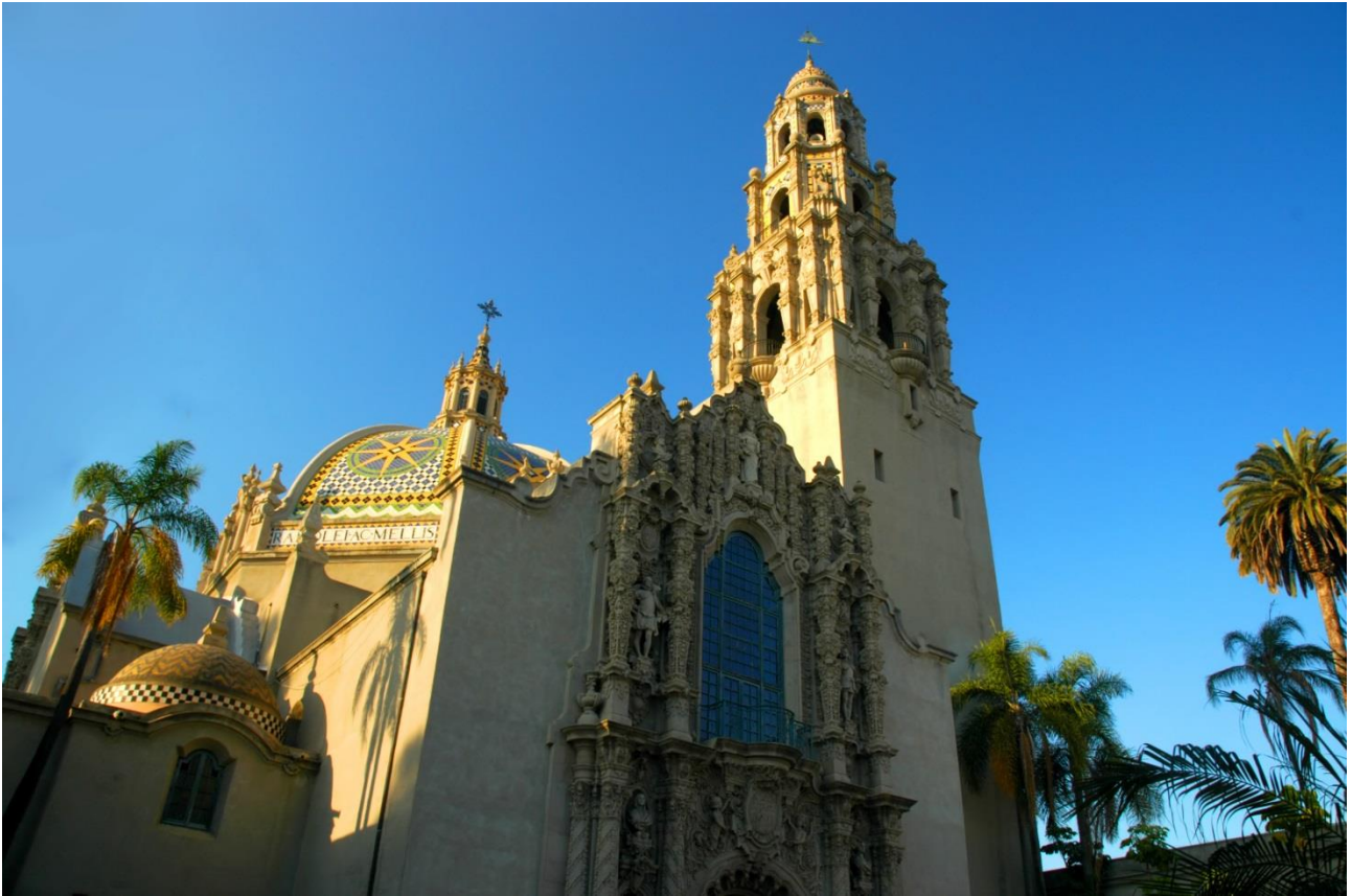
Balboa Park, San Diego, just three miles from the CMU campus