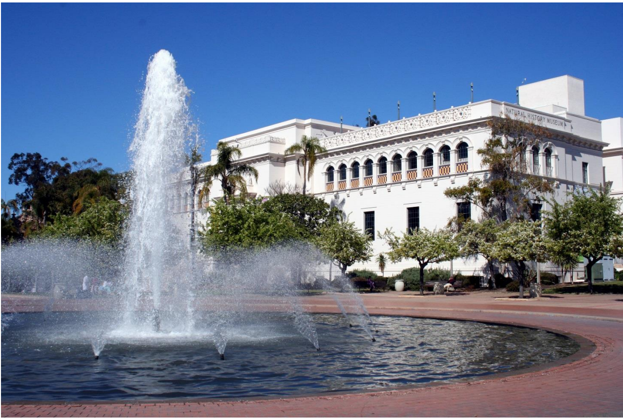
Balboa Park, San Diego, just three miles from the CMU campus