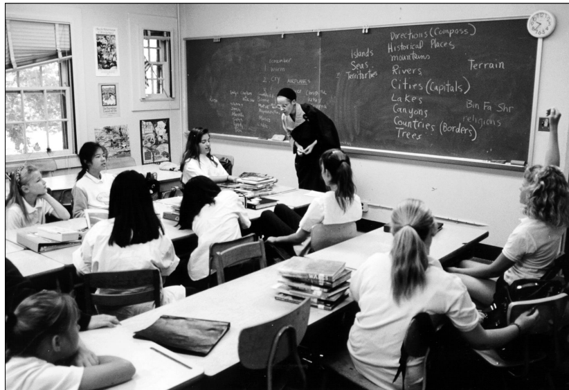
Developing Virtue Girls' School students during an in-class discussion led by an ordained nun.

Instilling Goodness Elementary School and Developing Virtue Secondary School, have been operating at the City of Ten Thousand Buddhas since 1973 and 1976 respectively. The Association also sponsors intensive retreats and meditation sessions; daily lectures on the Buddhist Sutras; and, periodic ordinations of Bhikshus and Bhikshunis (monks and nuns) into the orthodox Buddhist Sangha. The Association publishes the Buddhist monthly journal, Vajra Bodhi Sea.