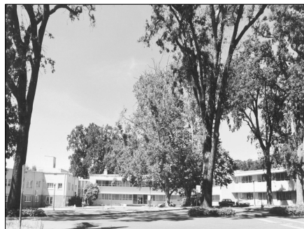
Tower of Blessings Home for the Elderly and CTTB Medical & Dental clinics.

The Sangha & Laity Training Programs are authorized by the U.S. Department of Immigration and Customs Enforcement [ICE] to admit non-immigrant foreign students. The Registrar's Department will provide information and an I-20 application for a foreign student visa [F-1] at no cost to the student; however, the student will be responsible for the costs of their own visa filing fees and postage. SLTP does not admit undocumented students. It is expected that graduates of SLTP will return to their own countries to pursue their vocations; moreover, student visas do not lead to permanent residency in the United States.