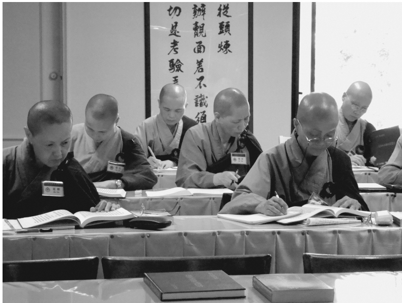
Sangha students studying and memorizing Vinaya texts.

The classroom instructor monitors the students' progress by observation of attendance, attentiveness, participation in the class format, and completion of assignments. A letter grade is assigned, indicating comprehension of the content covered in the class. Clock hours are earned as recorded on attendance records. Trainees who wish to take Dharma Realm Buddhist University classes for clock-hour and letter-grade credit in the Sangha or Laity Training Program, must complete a Special Studies Form, get the instructor's signature and then pass the form to the Registrar's Office.