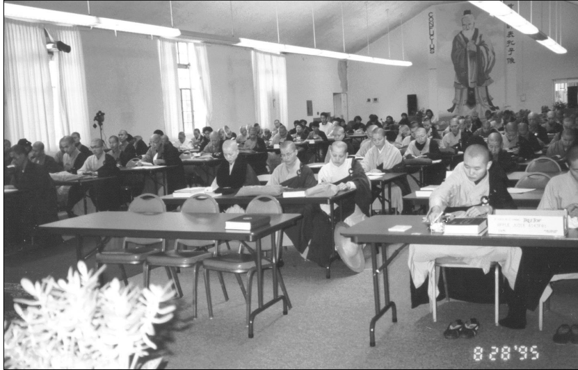
Vinaya class being held in the Dao Yuan (Source of the Way) Hall, City of Ten Thousand Buddhas.

This area provides qualified students in their fourth year of study the opportunity to apprentice in diverse aspects of monastic administration and community service. This may include classroom teaching-assistant training; learning to make curriculum aids and teaching materials; training in the management of worship halls, dormitories, libraries, and religious centers, such as temples, translation institutes, educational facilities, and retreat locations; greeting, providing for, and handling matters for guests; directing reception centers, and administering delegations and special events; counseling elementary and high school students; and offering programs that provide companionship, physical care, and moral support for the elderly. Students are assigned counselors, and each student conducts his or her training under the supervision of at least one certified instructor. Students may choose to conduct their apprenticeship on campus, or at a DRBA-authorized religious center.