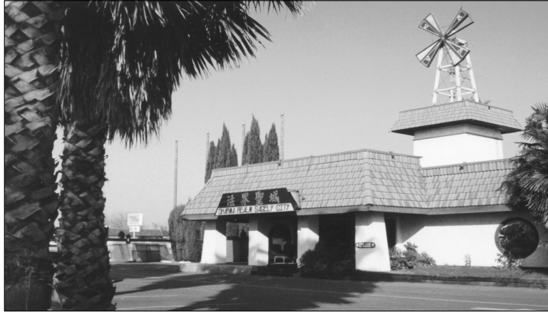
Entrance to the worship hall, City of the Dharma Realm, West Sacramento.