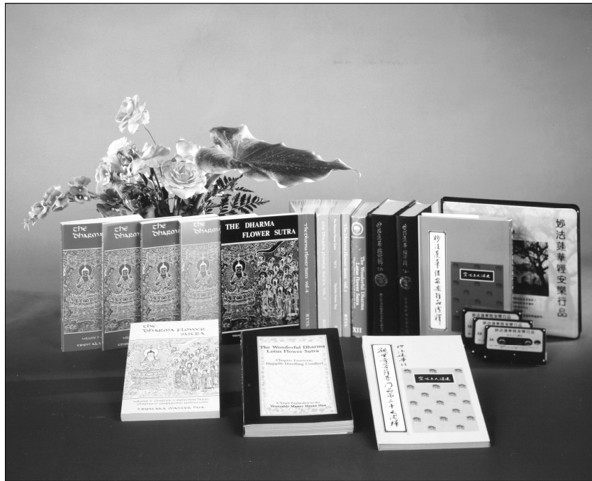
Books and Audio Tapes Published by the Buddhist Text Translation Society.

Recommended Readings: To be arranged by instructor.