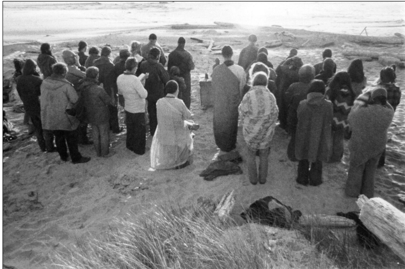
Culminating a Buddha-recitation session at Buddha Root Farm in Oregon, the Master and participants perform the Great Transference of merit on the shores of the Pacific at Sunset.

In June, 1995, not having paused to rest his entire life, the Venerable Master Hua entered Nirvana.