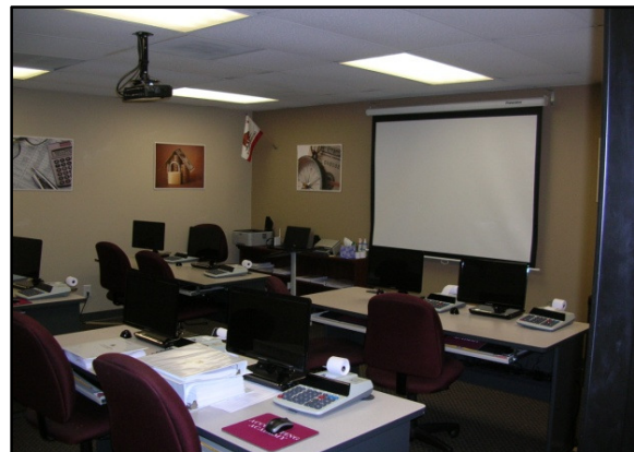
7283 Engineer Rd. Suite H San Diego CA 92111