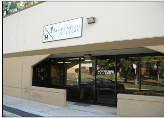
7283 Engineer Rd. Suite H San Diego CA 92111