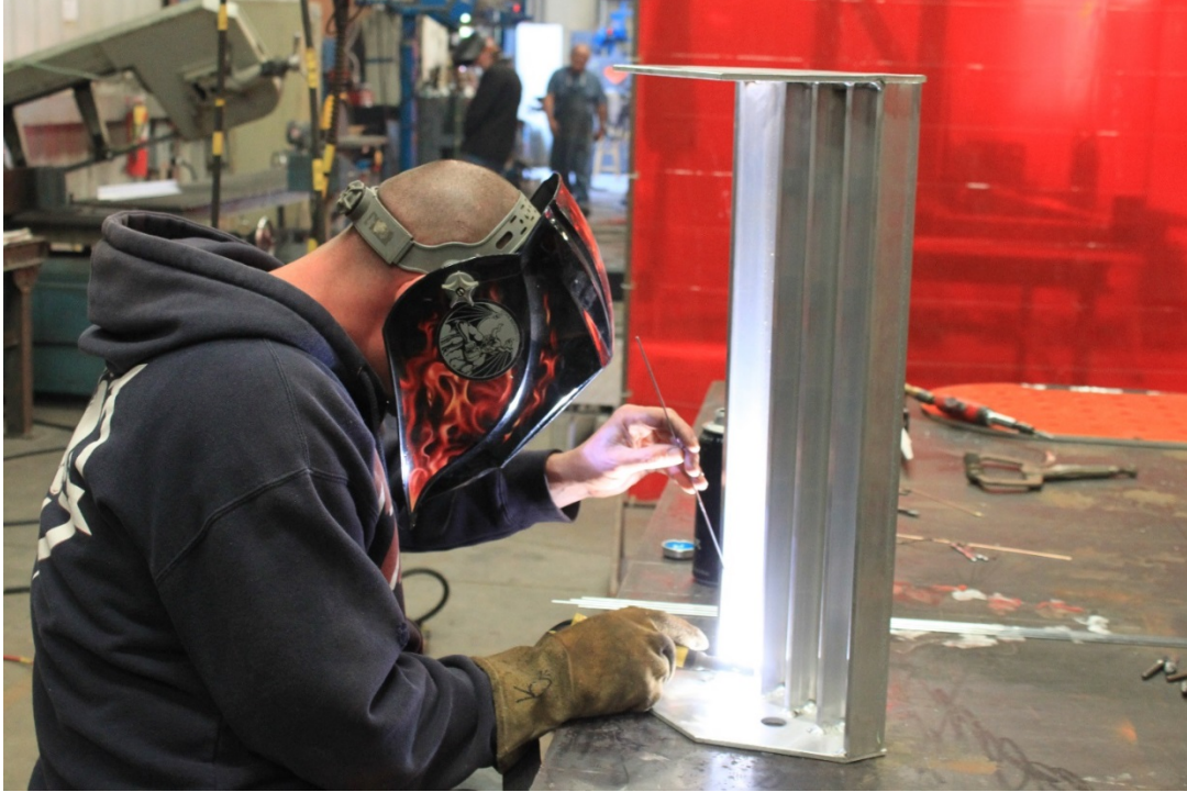
Figure 2: GTAW- TIG