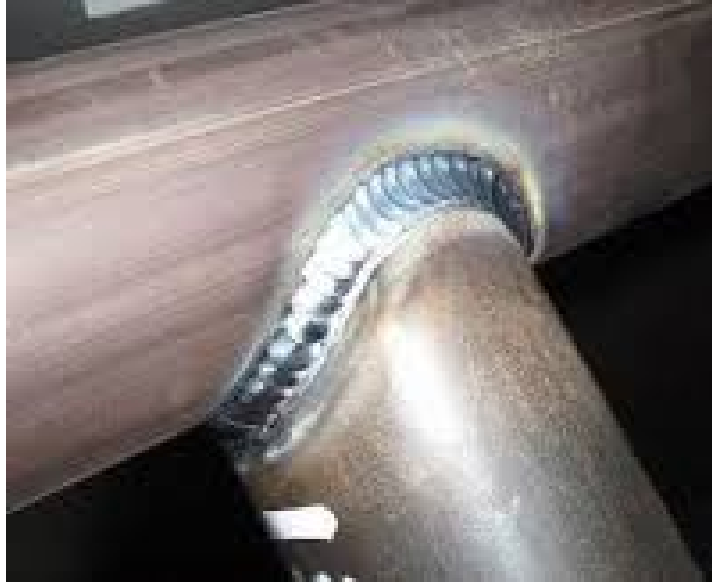
Figure 5: GTAW- TIG Pipe

Cost of courses are individually charged. Student is not obligated to attend all courses. If student decides to take all courses in sequence, the total charges for the entire educational program will be $11,900.00