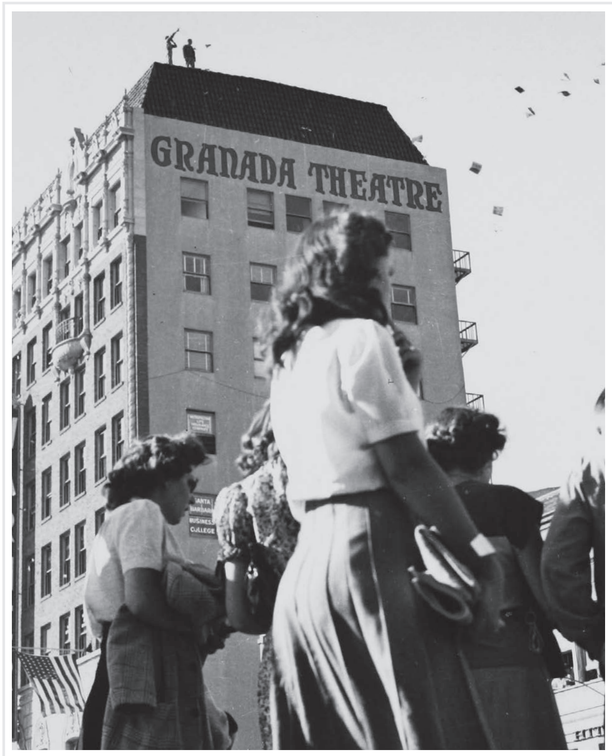
This photograph was taken August 14, 1945, the day World War II ended. Celebratory papers are being thrown from the roof of the Granada Building. Inside, when the news reached SBBCollege, class was dismissed!