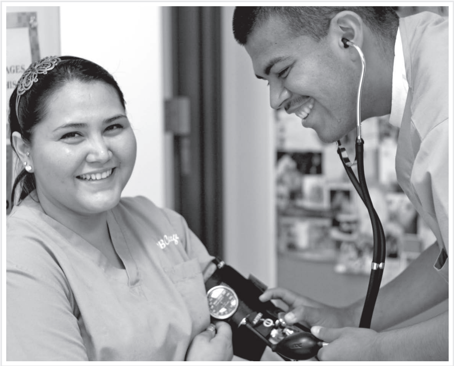
Medical assisting students take blood pressure readings in the medical lab.