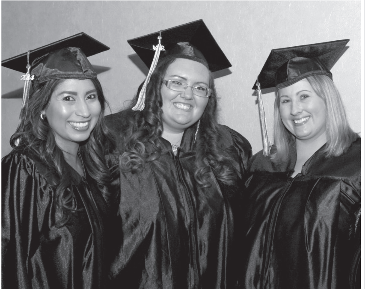
Business graduates celebrate their accomplishments at the SBBCollege commencement ceremony.