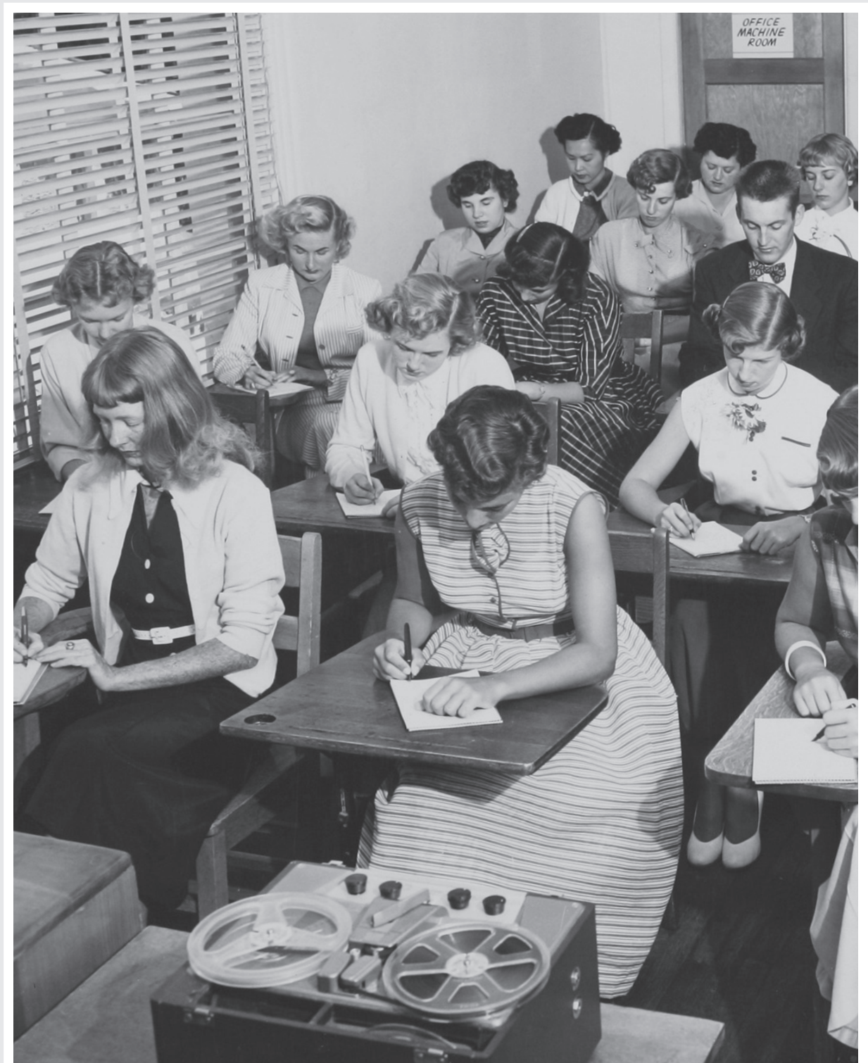
SBBCollege students practice note taking in this 1950's classroom photo.