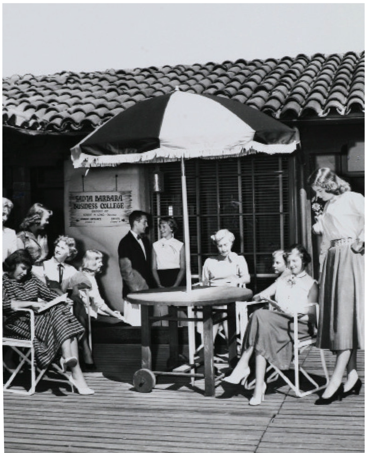
Students of the 1950's are seen here enjoying SBBCollege's sun deck in the La Placita Building.