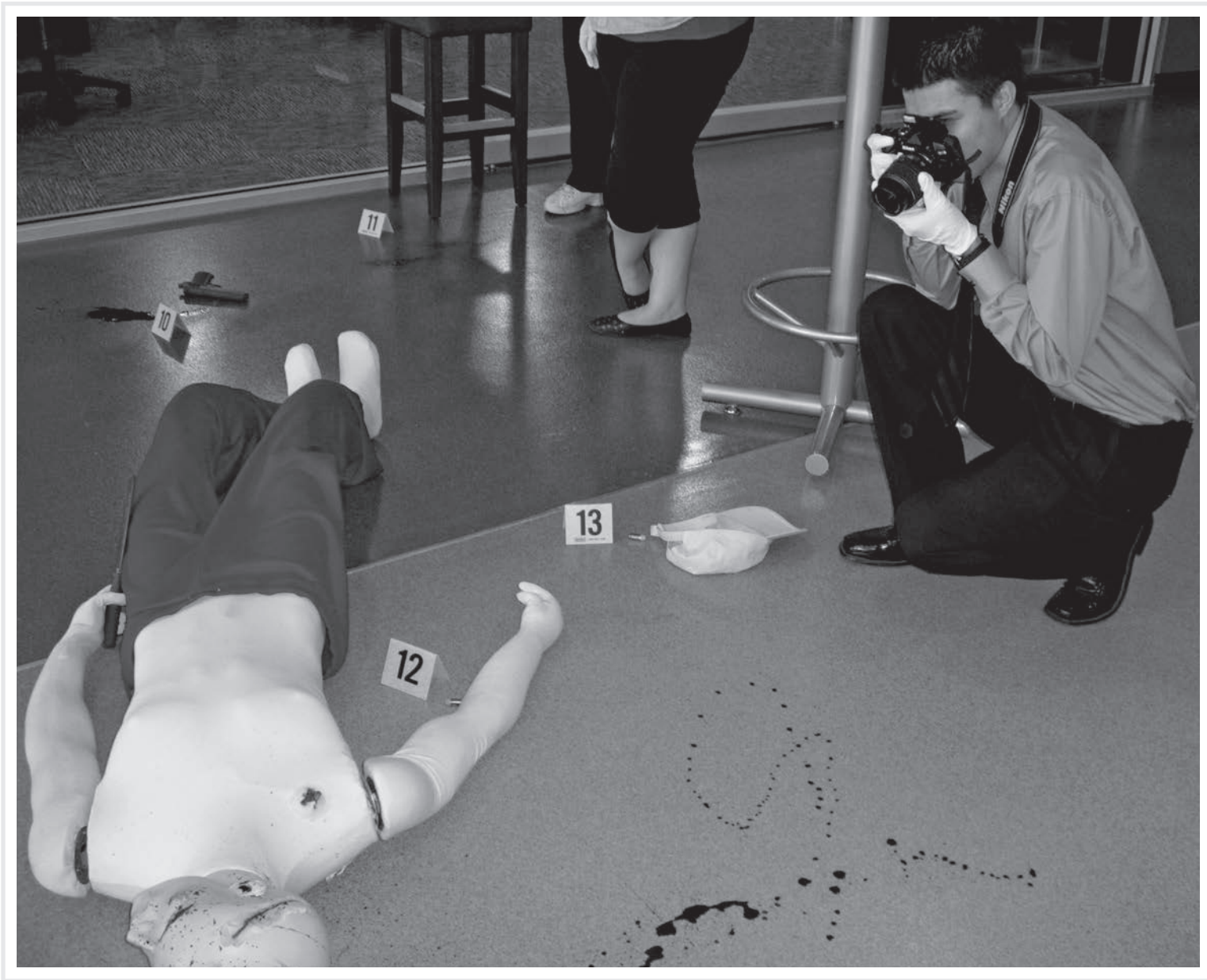
A student in the criminal justice program processes a mock crime scene.