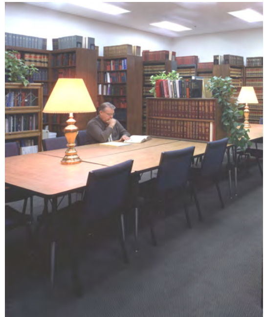
The Law Library houses over 10,000 volumes along with extensive computerized legal resources.

Computers are used as an integral part of the learning environment and are considered a part of the library facilities. High-speed and wireless Internet access is used as a library resource in several courses and classrooms. The College maintains a website at www.empcol.edu