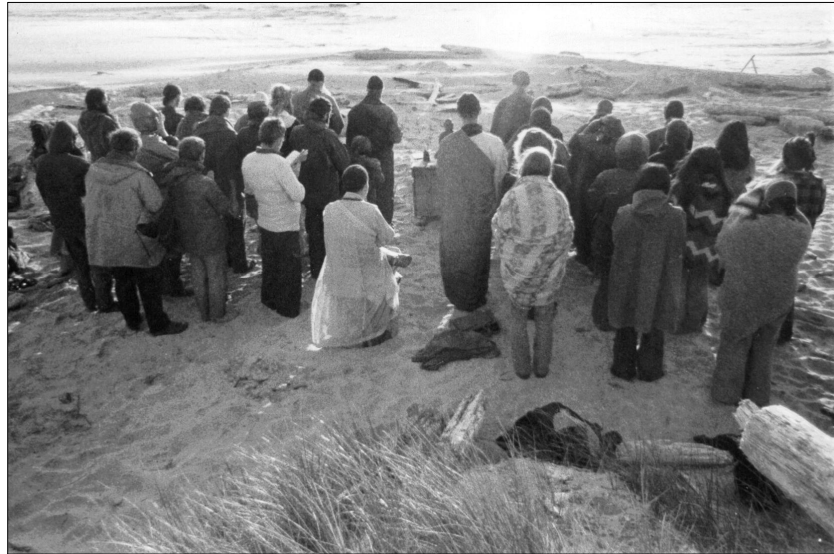
Culminating a Buddha-recitation session at Buddha Root Farm in Oregon, the Master and participants perform the Great Transference of merit on the shores of the Pacific at Sunset.

In June, 1995, not having paused to rest his entire life, the Venerable Master Hua entered Nirvana.