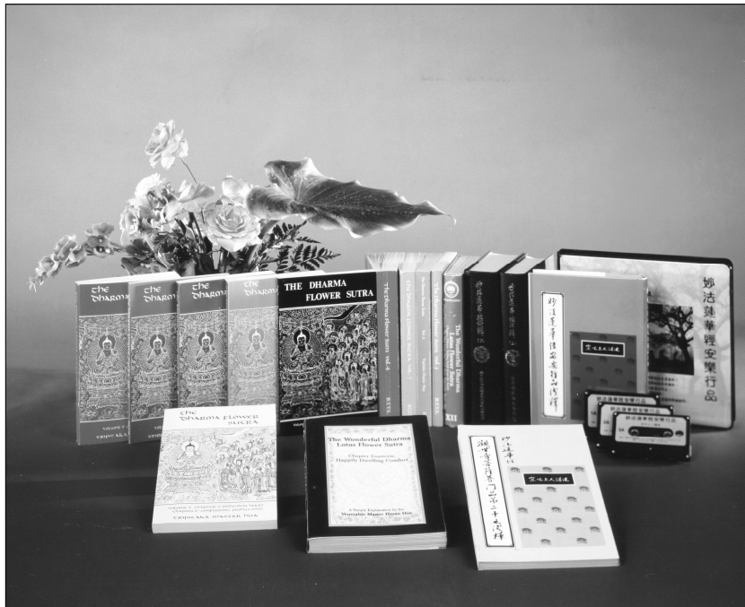
Books and Audio Tapes Published by the Buddhist Text Translation Society.

Recommended Readings: To be arranged by instructor.