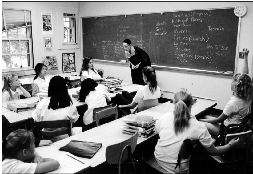
Developing Virtue Girls' School students during an in-class discussion led by an ordained nun.

Instilling Goodness Elementary School and Developing Virtue Secondary School, have been operating at the City of Ten Thousand Buddhas since 1973 and 1976 respectively. The Association also sponsors intensive retreats and meditation sessions; daily lectures on the Buddhist Sutras; and, periodic ordinations of Bhikshus and Bhikshunis (monks and nuns) into the orthodox Buddhist Sangha. The Association publishes the Buddhist monthly journal, Vajra Bodhi Sea.