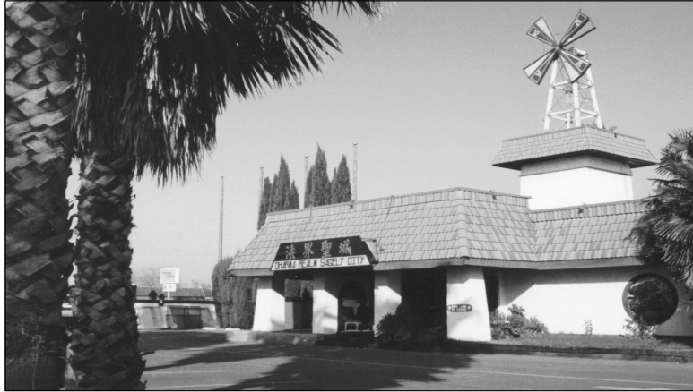
Entrance to the worship hall, City of the Dharma Realm, West Sacramento.