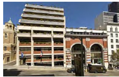
Picture 3 - The Building San Francisco Campus

Bay Area Medical Academy's main campus in San Francisco occupies approximately 9,000 square feet of classroom space and offices on two floors (2 nd and 3 rd floor of the building) specifically designed for training students in the health care field. There are four separate classrooms. The two Medical Assisting classrooms have a capacity of 24 students and feature a medical office set-up along one wall, including the latest technology setup with centrifuges, EKG machines, microscopes, ophthalmoscopes and U/A analyzers. The Phlebotomy classroom is adjacent to the Medical Assisting classroom and can accommodate 22 students. The Pharmacy Technician classroom has seating for 20 students. One of the Medical Assisting classrooms is also used for EKG instruction and can accommodate 24 students. The Pharmacy Technician classroom has a laboratory modeled after a real-life pharmacy. There is also a laboratory storage room, a small kitchenette/break-room, and a student lounge. All rooms are wheelchair accessible. The modern classrooms are tiled, air-conditioned, and well-lit. The laboratory storage room and the kitchenette have tile flooring, which facilitates cleaning. The facilities and the equipment used comply with all federal, state, and local ordinances and regulations, including those related to fire safety, building safety, and health. Restrooms are available on each floor and are located in the main hallway near the elevators.