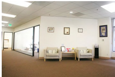
Picture 2 - The Lobby San Francisco Campus