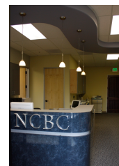
NCBC Catalogue 19