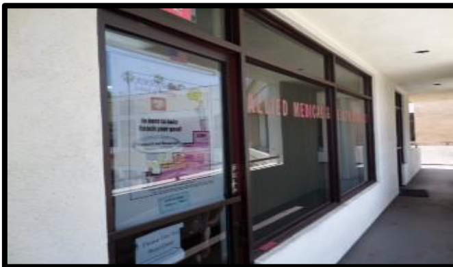
Figure 10: Room 208/209 Corridor