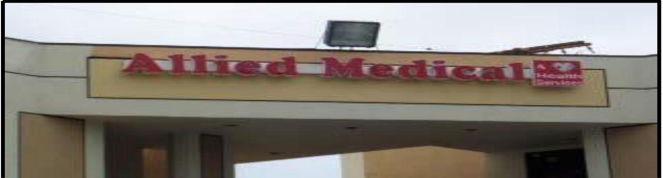
Figure 1 Façade: Allied Medical & Health Svs., Inc. Signage on 730 S. Central Ave, Glendale CA 91204.

1. PHYSICAL FACILITIES: Classroom at Room 208 is 550 sq ft. Maximum capacity of 30 persons, 30 chairs and 18 tables with a seating capacity of 35. One table for faculty, chalkboard (46" x 28"), TV/VCR/DVD and space available for hospital bed, in case of demonstration or other laboratory works.