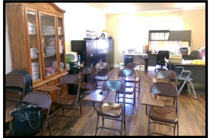
Figures 6-7: Rescare Glenridge Center classroom and lab – 611 S. Central Ave. Glendale, CA 91204