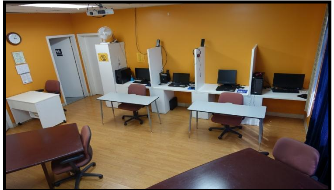
Figure 3: Room 208 Tables & Computer Stations