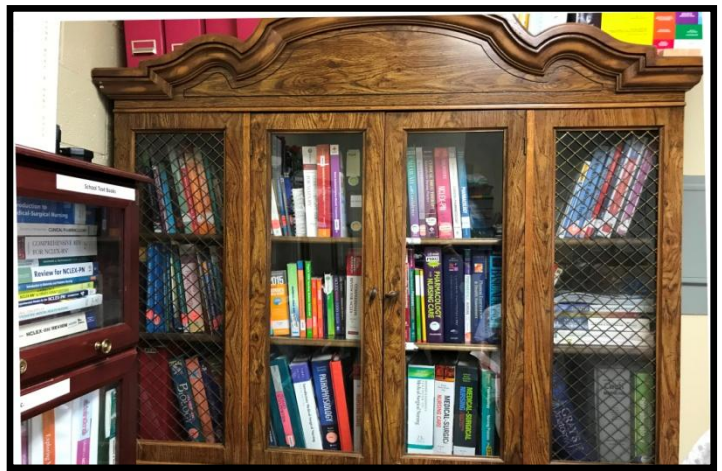
Figures 8-9: Library