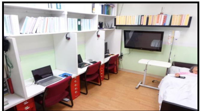
Figures 4-5: Room 209 Computer Lab