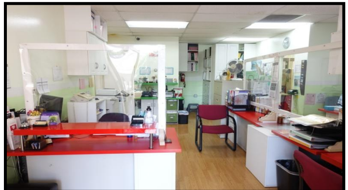
Figure 11: Room 209 Office