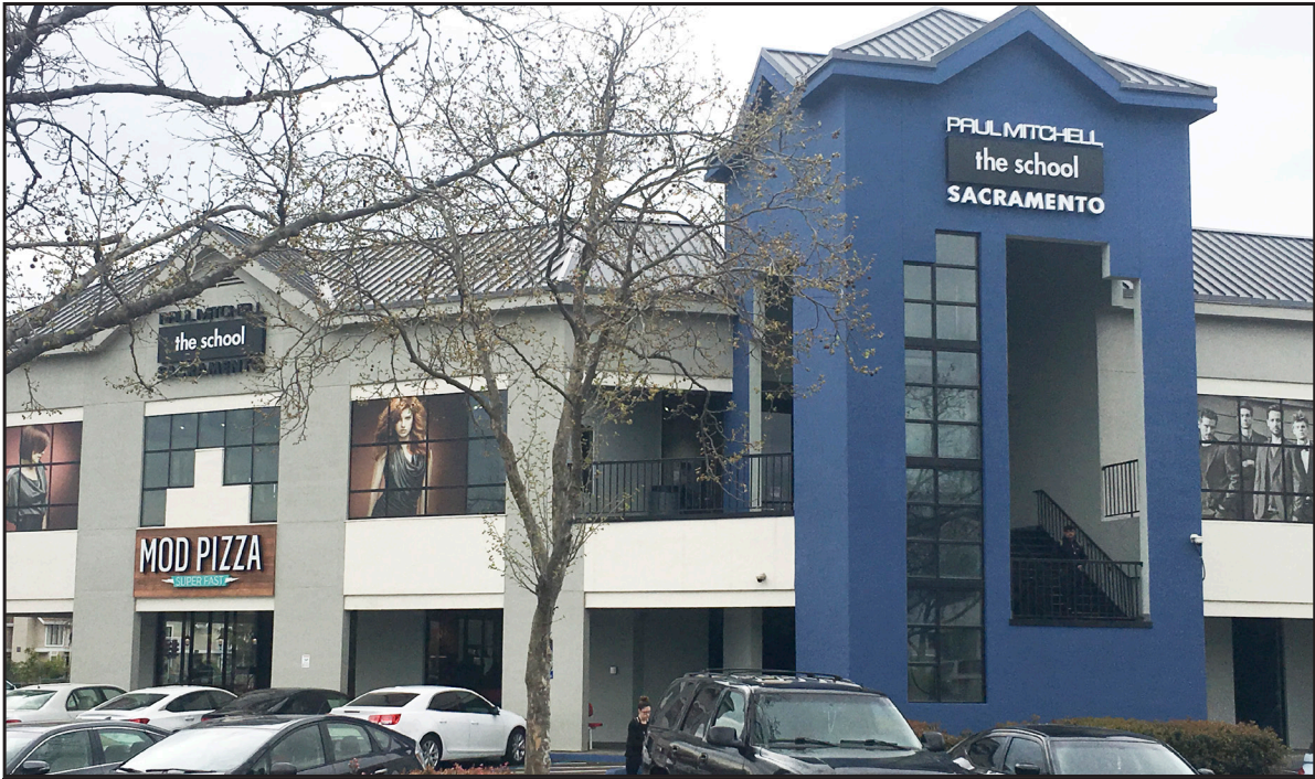
Paul Mitchell The School Sacramento