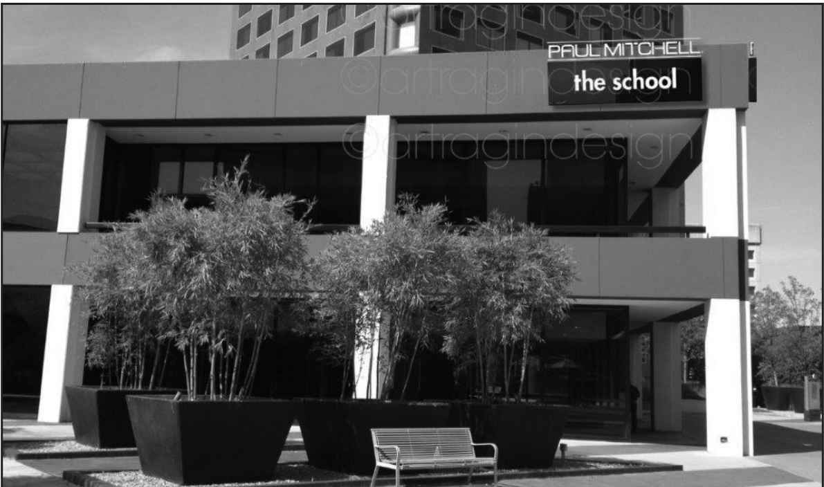
Paul Mitchell The School San Jose