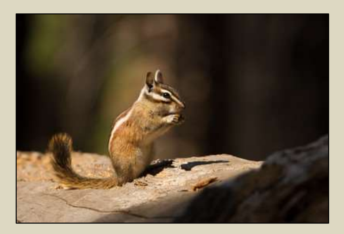
ReWilding Sequoia National Park, CA. 2015