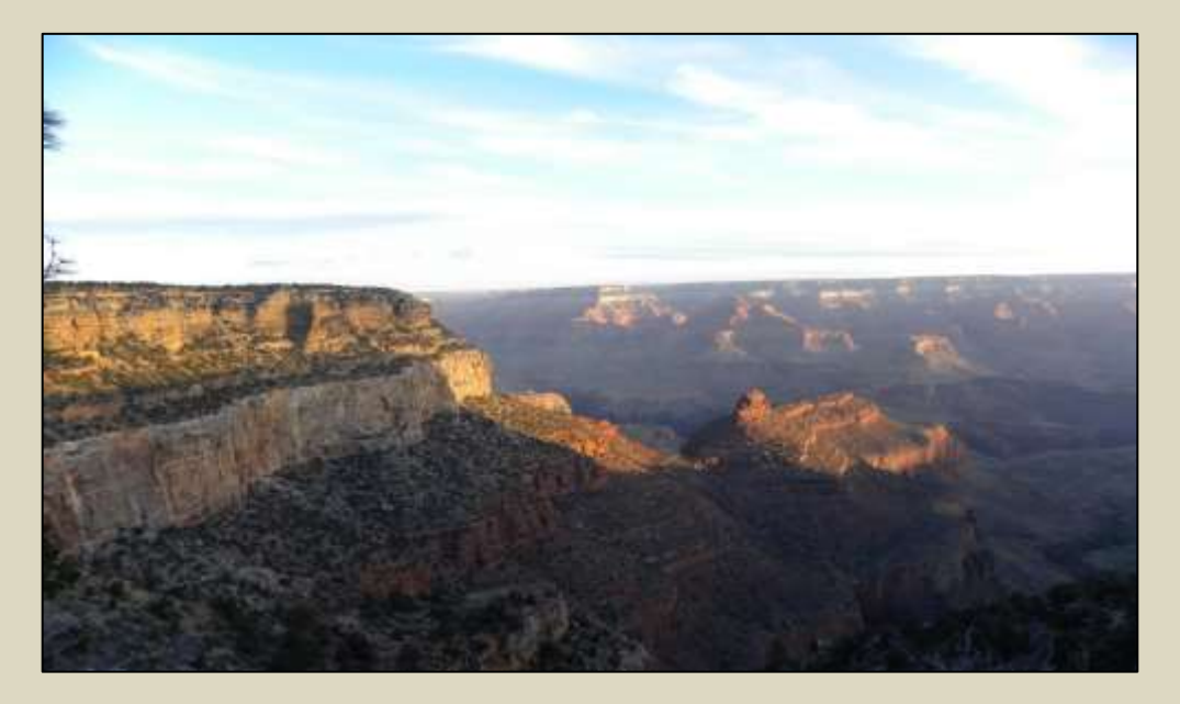
ReWilding Grand Canyon National Park, AZ. 2014

Viridis Graduate Institute prohibits the use of alcohol, drugs, drug activity and/or paraphernalia used in illicit drug activity by any of its students, faculty, or administration at all ReWilding activities, or any other of its activities. Any violation of this policy will result in immediate dismissal from Viridis Graduate Institute's programs.