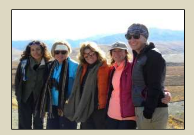
ReWilding Denali National Park, AK. 2017