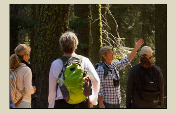
ReWilding Sequoia National Park, CA. 2015