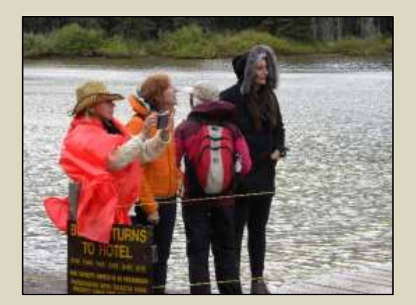
ReWilding Glacier National Park, MT. 2016