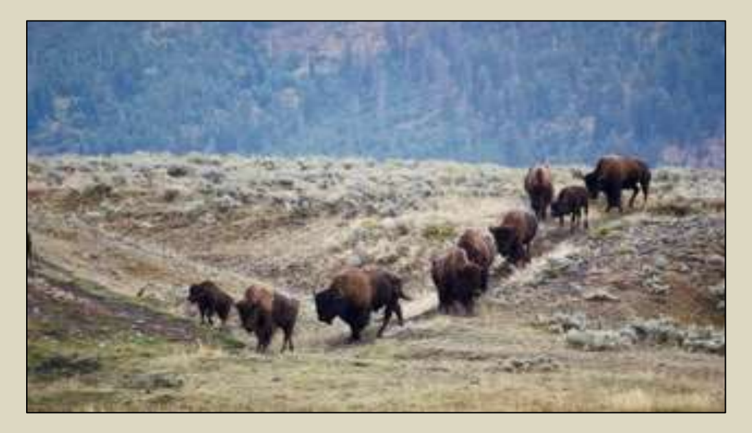
ReWilding Yellowstone National Park, WY. 2018

VGI's information technology director is responsible for the overall planning, organizing, and execution of all IT functions, including backup and security. This includes directing all IT operations to meet the Institute's requirements as well as the support and maintenance of existing applications and development of new solutions that better serve Viridis Graduate Institute and its students.