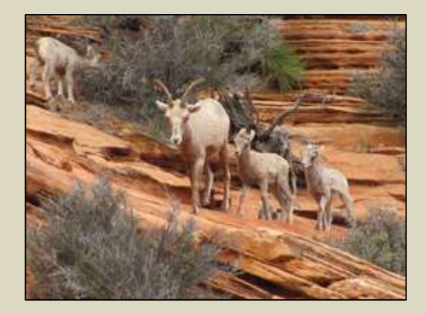
ReWilding Zion National Park, UT. 2016