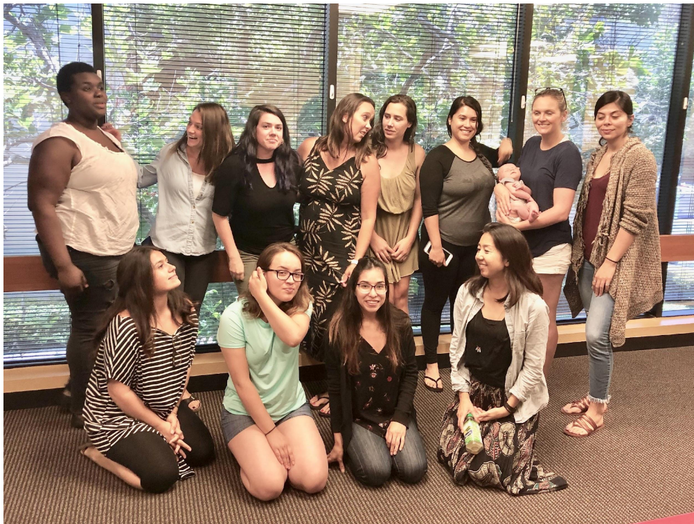
Class of 2020