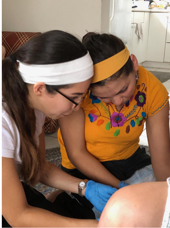
Nizhoni student catching a baby with her preceptor