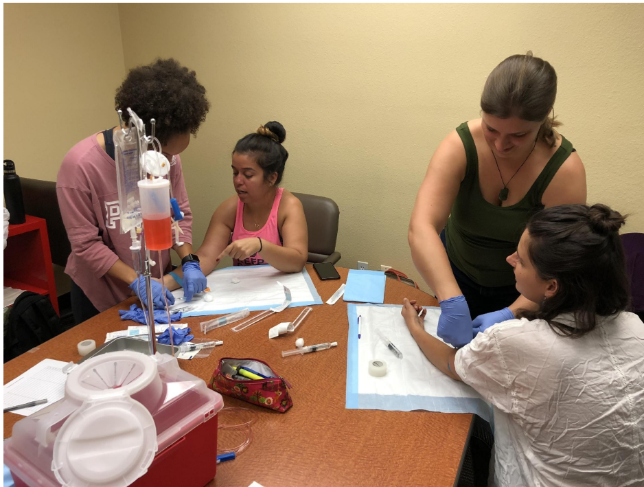
Students practicing intravenous catheter insertion.

The process for obtaining the CPM credential is rigorous and competency-based. This credential has been reviewed by experts in the fields of health care and education. NARM recently received the prestigious accreditation of the National Commission for Certifying Agencies, the accrediting body of the Institute for Credentialing Excellence (formerly the National Organization for Competency Assurance). The National Commission for Certifying Agencies was created in 1997 to accredit certification programs and organizations that assess professional competency. It is considered the highest certification an accrediting body can attain.