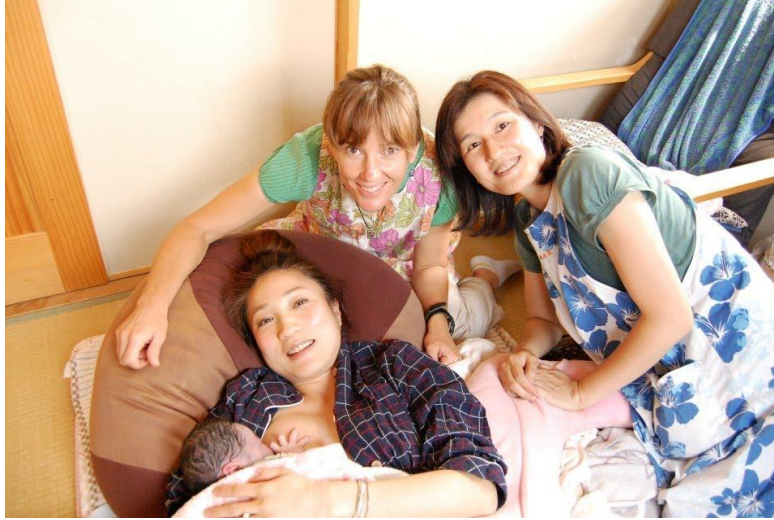
Welcoming a new life at a birth house in Japan

Email info@meacschools.org Complainants will receive an acknowledgement of receipt within 30 days.