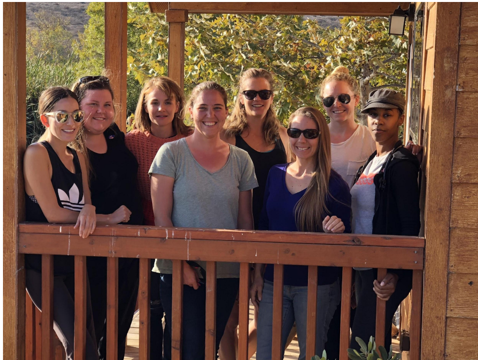
Class of 2018