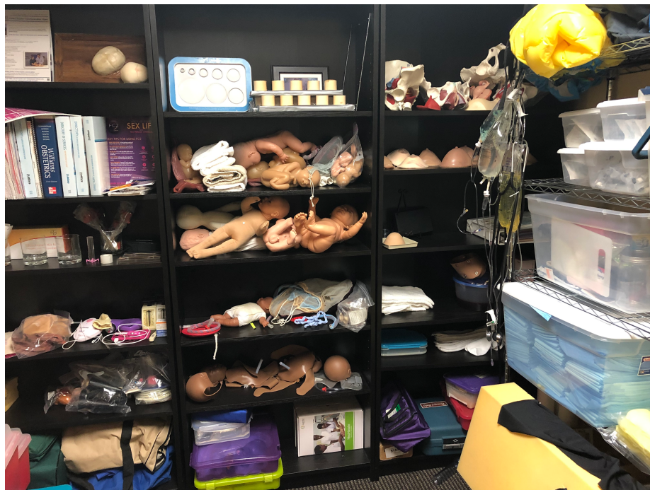
Simulation and practice equipment and supplies.

The curriculum of Nizhoni Institute of Midwifery meets or exceeds the requirements for approval of midwifery educational programs in the United States. Students should check with midwifery regulatory bodies in the states or countries in which they intend to practice regarding specific requirements for midwifery education and practice.