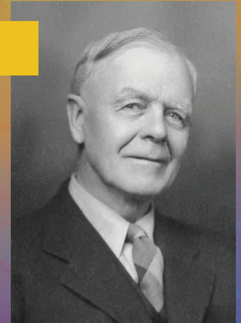
William Garner Sutherland, D.O. (1873–1954)

...was an American osteopathic physician and important figure in American osteopathic medicine. Several of his manual therapy techniques are still practiced today by a small minority of practitioners of osteopathic medicine. Sutherland was the first osteopathic physician to conceptualize the cranial approach and teach it systematically. However, Sutherland acknowledged Andrew Taylor Still as the developer of all osteopathy, including the cranial approach. Sutherland was the first person to claim to feel a rhythmic shape change in the bones of the cranium. He later applied this movement to all body tissues and this movement is the agent of change in dysfunctional tissues. He later named this motion the body's "Primary Respiration."