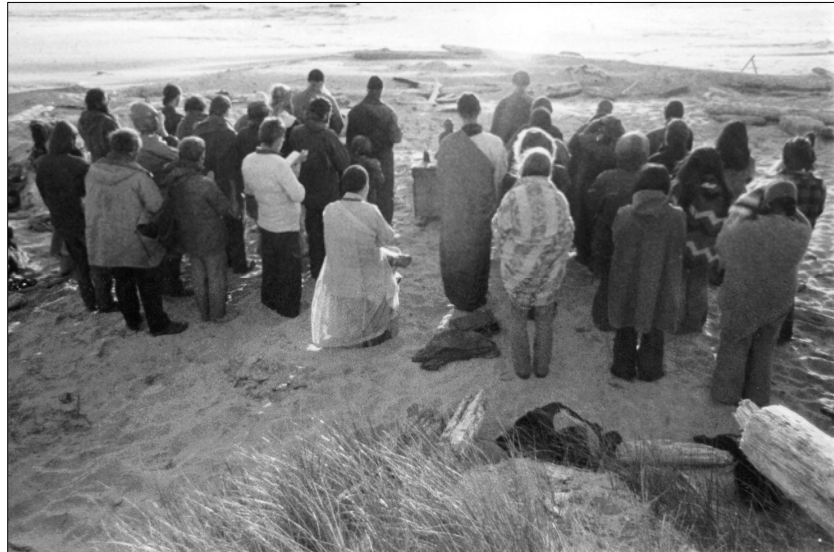
Culminating a Buddha-recitation session at Buddha Root Farm in Oregon, the Master and participants perform the Great Transference of merit on the shores of the Pacific at Sunset.

In June, 1995, not having paused to rest his entire life, the Venerable Master Hua entered Nirvana.