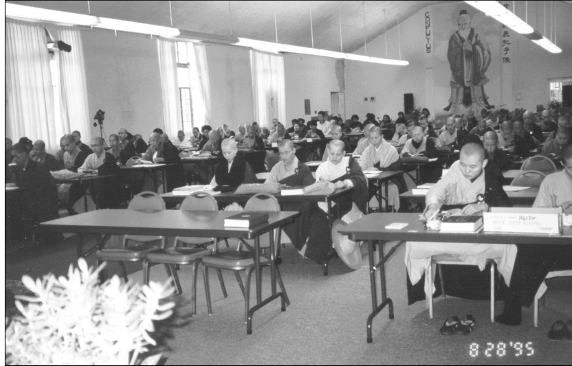
Vinaya class being held in the Dao Yuan (Source of the Way) Hall, City of Ten Thousand Buddhas.

This area provides qualified students in their fourth year of study the opportunity to apprentice in diverse aspects of monastic administration and community service. This may include classroom teaching-assistant training; learning to make curriculum aids and teaching materials; training in the management of worship halls, dormitories, libraries, and religious centers, such as temples, translation institutes, educational facilities, and retreat locations; greeting, providing for, and handling matters for guests; directing reception centers, and administering delegations and special events; counseling elementary and high school students; and offering programs that provide companionship, physical care, and moral support for the elderly. Students are assigned counselors, and each student conducts his or her training under the supervision of at least one certified instructor. Students may choose to conduct their apprenticeship on campus, or at a DRBA-authorized religious center.