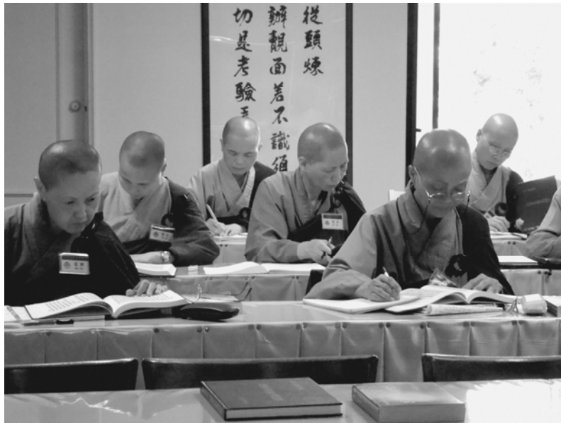
Sangha students studying and memorizing Vinaya texts.

The classroom instructor monitors the students' progress by observation of attendance, attentiveness, participation in the class format, and completion of assignments. A letter grade is assigned, indicating comprehension of the content covered in the class. Clock hours are earned as recorded on attendance records. Trainees who wish to take Dharma Realm Buddhist University classes for clock-hour and letter-grade credit in the Sangha or Laity Training Program, must complete a Special Studies Form, get the instructor's signature and then pass the form to the Registrar's Office.