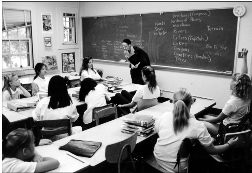
Developing Virtue Girls' School students during an in-class discussion led by an ordained nun.

Instilling Goodness Elementary School and Developing Virtue Secondary School, have been operating at the City of Ten Thousand Buddhas since 1973 and 1976 respectively. The Association also sponsors intensive retreats and meditation sessions; daily lectures on the Buddhist Sutras; and, periodic ordinations of Bhikshus and Bhikshunis (monks and nuns) into the orthodox Buddhist Sangha. The Association publishes the Buddhist monthly journal, Vajra Bodhi Sea.