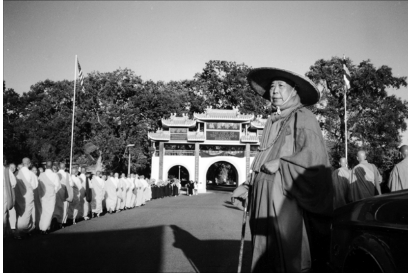
The Venerable Master presiding at Full Ordination Ceremonies.

the Sixth Patriarch's Sutra , the Buddha Speaks of Amitabha Sutra , the Sutra in Forty-Two Sections , both National Master Ch'ing Liang's Preface and Prologue , and the Chapter on the Conduct and Vows of Universal Worthy Bodhisattva from the Avatamsaka Sutra , as well as the Hundred Dharmas Shastra , and Shastra on the Awakening of Faith , and the Sbramanera Vinaya .