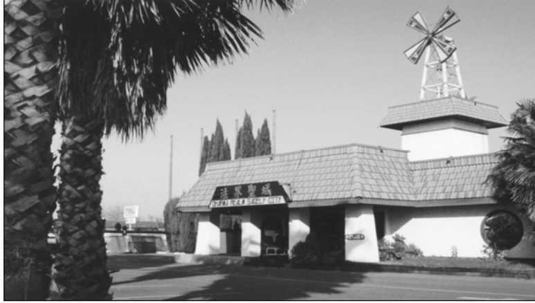
Entrance to the worship hall, City of the Dharma Realm, West Sacramento.