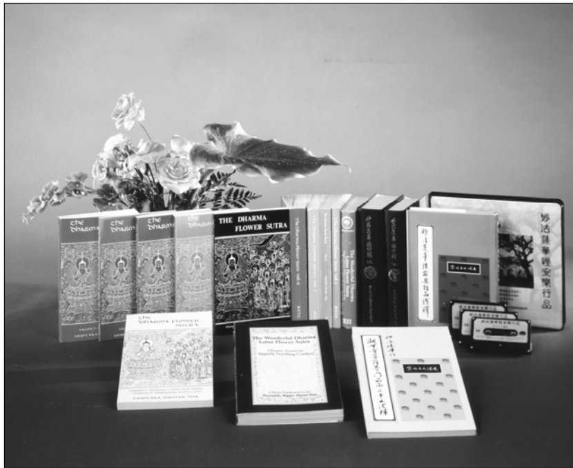
Books and Audio Tapes Published by the Buddhist Text Translation Society.

Recommended Readings: To be arranged by instructor.