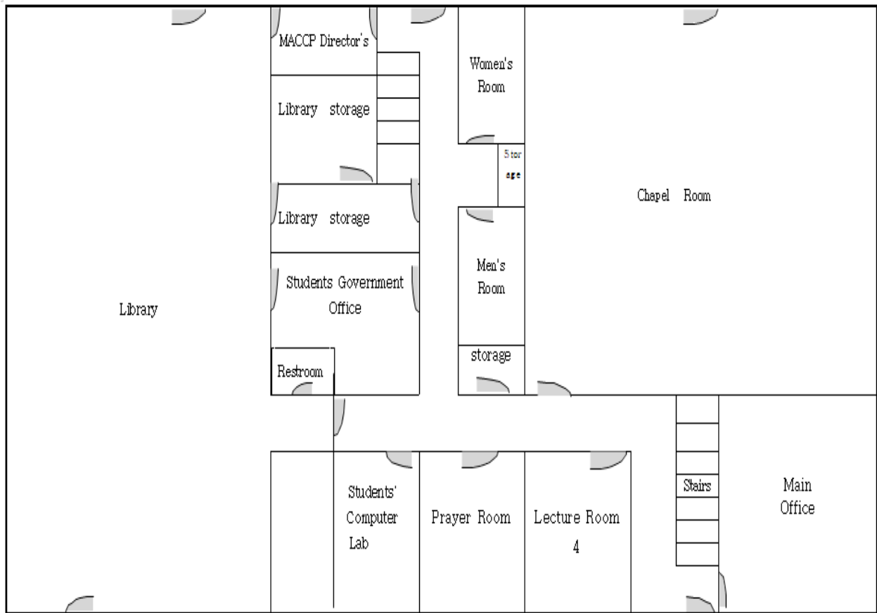
<Carmenita Building 1st floor>