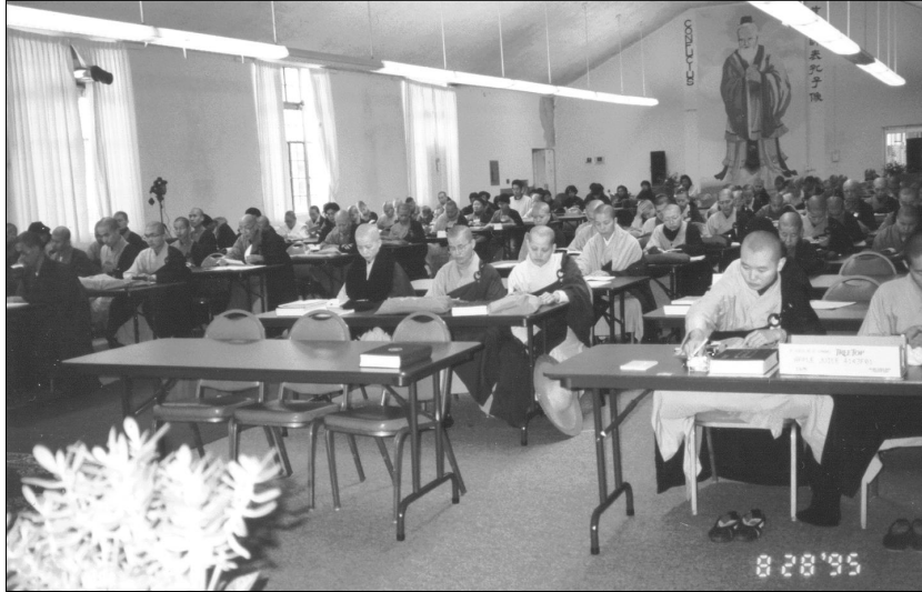
Vinaya class being held in the Dao Yuan (Source of the Way) Hall, City of Ten Thousand Buddhas.

This area provides qualified students in their fourth year of study the opportunity to apprentice in diverse aspects of monastic administration and community service. This may include classroom teaching-assistant training; learning to make curriculum aids and teaching materials; training in the management of worship halls, dormitories, libraries, and religious centers, such as temples, translation institutes, educational facilities, and retreat locations; greeting, providing for, and handling matters for guests; directing reception centers, and administering delegations and special events; counseling elementary and high school students; and offering programs that provide companionship, physical care, and moral support for the elderly. Students are assigned counselors, and each student conducts his or her training under the supervision of at least one certified instructor. Students may choose to conduct their apprenticeship on campus, or at a DRBA-authorized religious center.