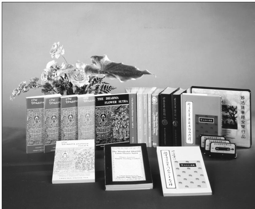
Books and Audio Tapes Published by the Buddhist Text Translation Society.

Recommended Readings: To be arranged by instructor.