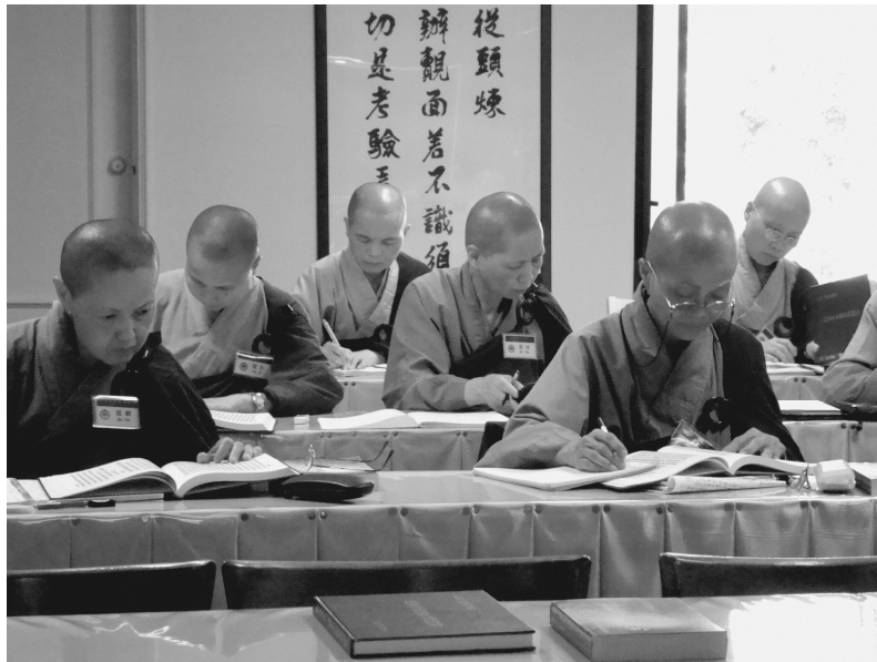
Sangha students studying and memorizing Vinaya texts.

The classroom instructor monitors the students' progress by observation of attendance, attentiveness, participation in the class format, and completion of assignments. A letter grade is assigned, indicating comprehension of the content covered in the class. Clock hours are earned as recorded on attendance records. Trainees who wish to take Dharma Realm Buddhist University classes for clock-hour and letter-grade credit in the Sangha or Laity Training Program, must complete a Special Studies Form, get the instructor's signature and then pass the form to the Registrar's Office.