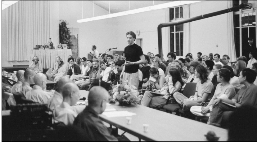
Visiting students direct questions to a panel of monks and nuns during a weekend retreat.