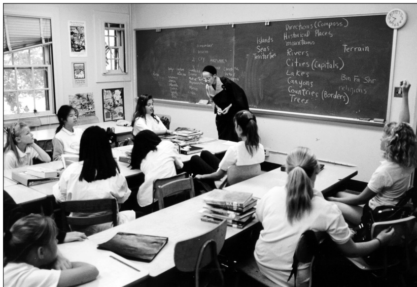
Developing Virtue Girls' School students during an in-class discussion led by an ordained nun.

Instilling Goodness Elementary School and Developing Virtue Secondary School, have been operating at the City of Ten Thousand Buddhas since 1973 and 1976 respectively. The Association also sponsors intensive retreats and meditation sessions; daily lectures on the Buddhist Sutras; and, periodic ordinations of Bhikshus and Bhikshunis (monks and nuns) into the orthodox Buddhist Sangha. The Association publishes the Buddhist monthly journal, Vajra Bodhi Sea.