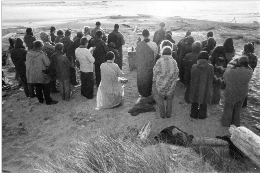
Culminating a Buddha-recitation session at Buddha Root Farm in Oregon, the Master and participants perform the Great Transference of merit on the shores of the Pacific at Sunset.

In June, 1995, not having paused to rest his entire life, the Venerable Master Hua entered Nirvana.