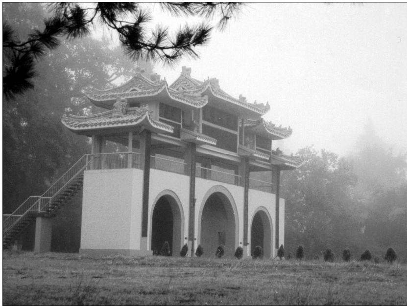
Entrance to the City of Ten Thousand Buddhas.