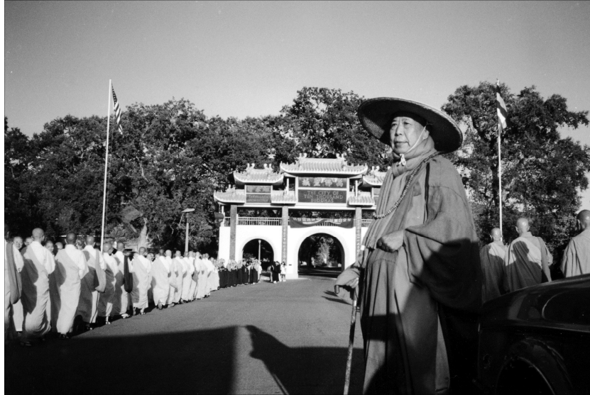
The Venerable Master presiding at Full Ordination Ceremonies.

the Sixth Patriarch's Sutra , the Buddha Speaks of Amitabha Sutra , the Sutra in Forty-Two Sections , both National Master Ch'ing Liang's Preface and Prologue , and the Chapter on the Conduct and Vows of Universal Worthy Bodhisattva from the Avatamsaka Sutra , as well as the Hundred Dharmas Shastra , and Shastra on the Awakening of Faith , and the Shramanera Vinaya .