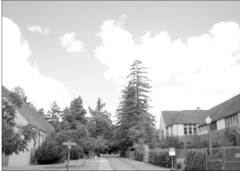
View of Wordless Hall and road towards Wonderful Enlightened Mountain.