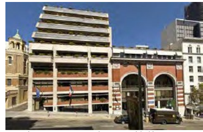
Picture 3 - The Building San Francisco Campus

BAMA Institute’s main campus in San Francisco occupies approximately 9,000 square feet of classroom space and offices on two floors (2 nd and 3 rd floor of the building) specifically designed for training students in the health care field.