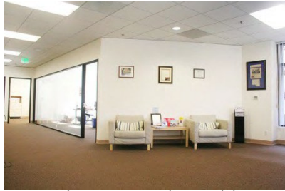
Picture 2 - The Lobby San Francisco Campus