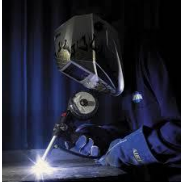
Figure 3: GMAW-MIG Aluminum