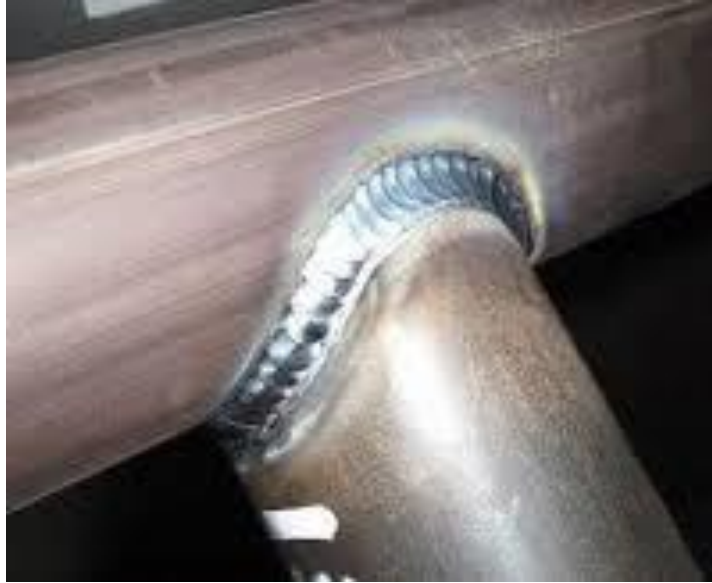
Figure 5: GTAW- TIG Pipe

Cost of courses are individually charged. Student is not obligated to attend all courses. If student decides to take all courses in sequence, the total charges for the entire educational program will be $14,737.50.