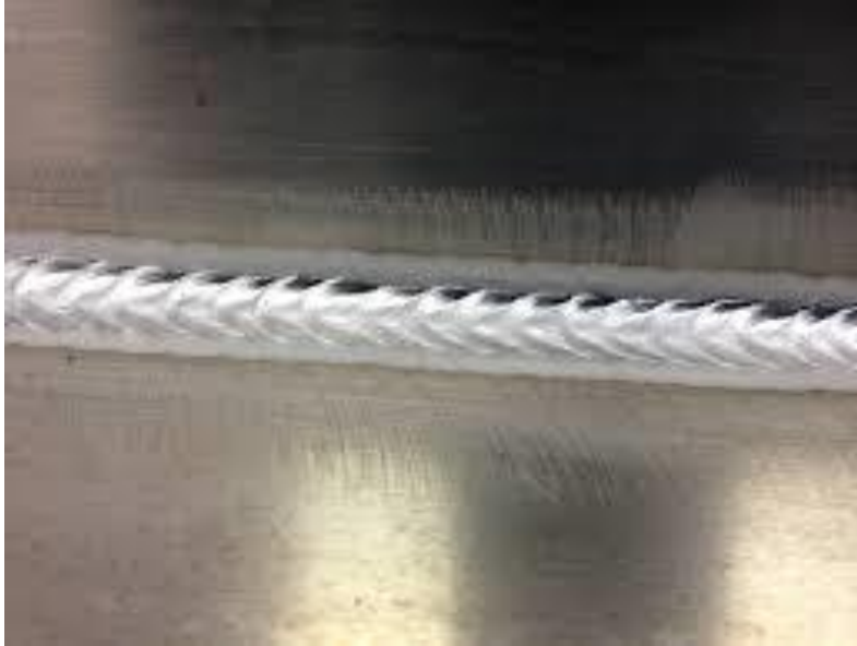
Figure 4: GMAW- MIG Advanced