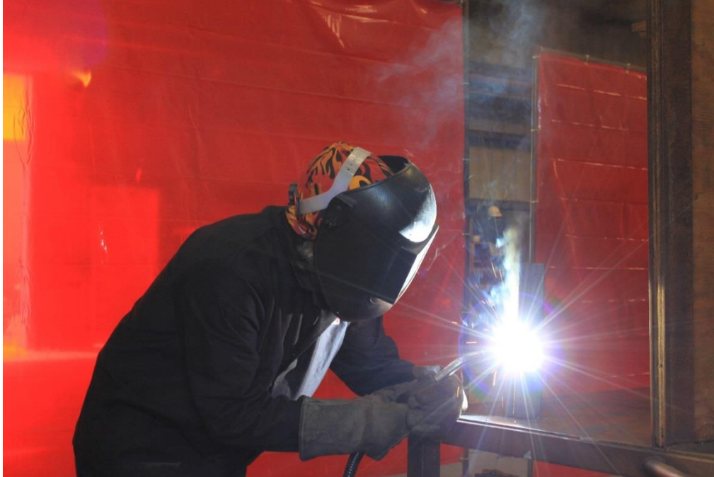
Figure 1: FCAW- Flux Cored