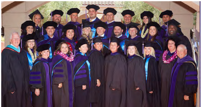
Congressman Mike Thompson (front row, left) delivered the commencement address to the Class of 2016.

Students should retain copies of all forms and information sent to and received from the Committee of Bar Examiners.