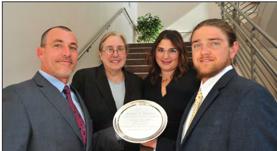
2019 2 nd Place for Oral Argument Best Appellant's Brief

In April 2000, Empire College School of Law's Moot Court Team captured first place at the 31 st Annual California Moot Court Competition. In 2001, Empire's team captured gold again at the State Bar's Environmental Negotiation Competition. Competing law schools included UCLA, Loyola, Pepperdine, Santa Clara, UC Davis, and UC Berkeley. Empire's teams also placed in the 2002, 2003, 2004, 2006, 2007, 2008, 2009, 2010, 2018, and 2019 California Moot Court Competitions.