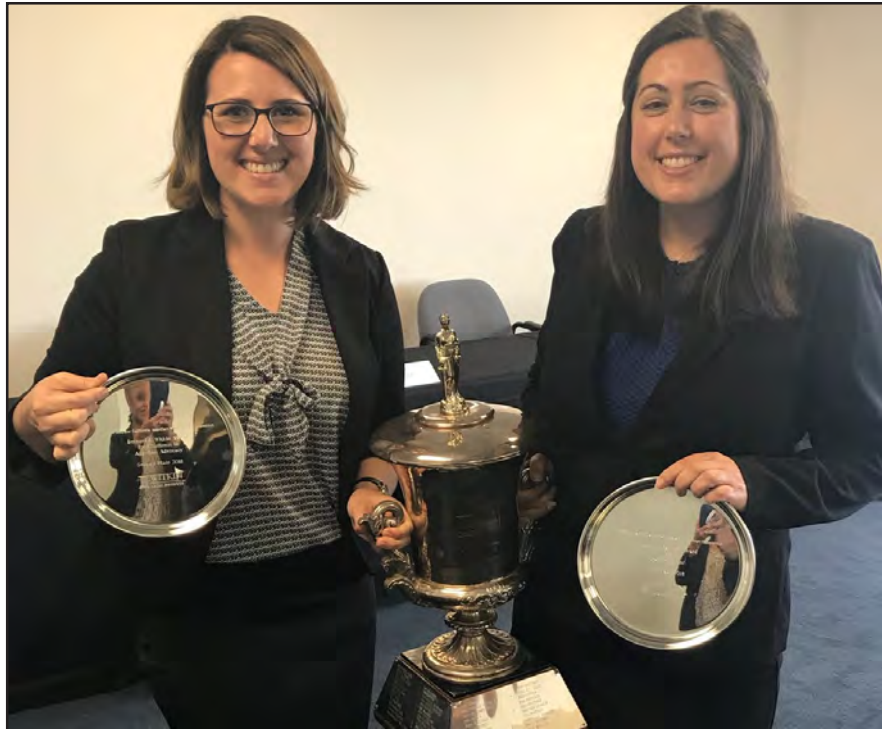
2018 Roger J. Traynor Award 1 st Place for Oral Argument

In April 2000, Empire College School of Law's Moot Court Team captured first place at the 31 st Annual California Moot Court Competition. In 2001, Empire's team captured gold again at the State Bar's Environmental Negotiation Competition. Competing law schools included UCLA, Loyola, Pepperdine, Santa Clara, UC Davis, and UC Berkeley. Empire's teams also placed in the 2002, 2003, 2004, 2006, 2007, 2008, 2009, 2010, 2018, and 2019 California Moot Court Competitions.