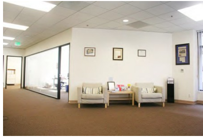
Picture 2 - The Lobby San Francisco Campus