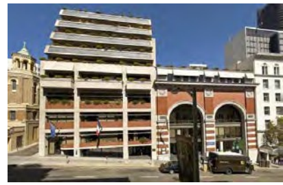
Picture 3 - The Building San Francisco Campus

Bay Area Medical Academy's main campus in San Francisco occupies approximately 9,000 square feet of classroom space and offices on two floors (2 nd and 3 rd floor of the building) specifically designed for training students in the health care field. There are four separate classrooms. The two Medical Assisting classrooms have a capacity of 24 students and feature a medical office set-up along one wall, including the latest technology setup with centrifuges, EKG machines, microscopes, ophthalmoscopes and U/A analyzers. The Phlebotomy classroom is adjacent to the Medical Assisting classroom and can accommodate 22 students. One of the Medical Assisting classrooms is also used for EKG instruction and can accommodate 24 students. There is also a laboratory storage room, a small kitchenette/break-room, and a student lounge. All rooms are wheelchair accessible. The modern classrooms are tiled, air-conditioned, and well-lit. The laboratory storage room and the kitchenette have tile flooring, which facilitates cleaning. The facilities and the equipment used comply with all federal, state, and local ordinances and regulations, including those related to fire safety, building safety, and health. Restrooms are available on each floor and are located in the main hallway near the elevators.