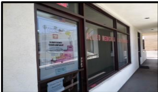
Figure 10: Room 208/209 Corridor