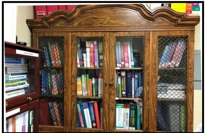
Figures 8-9: Library