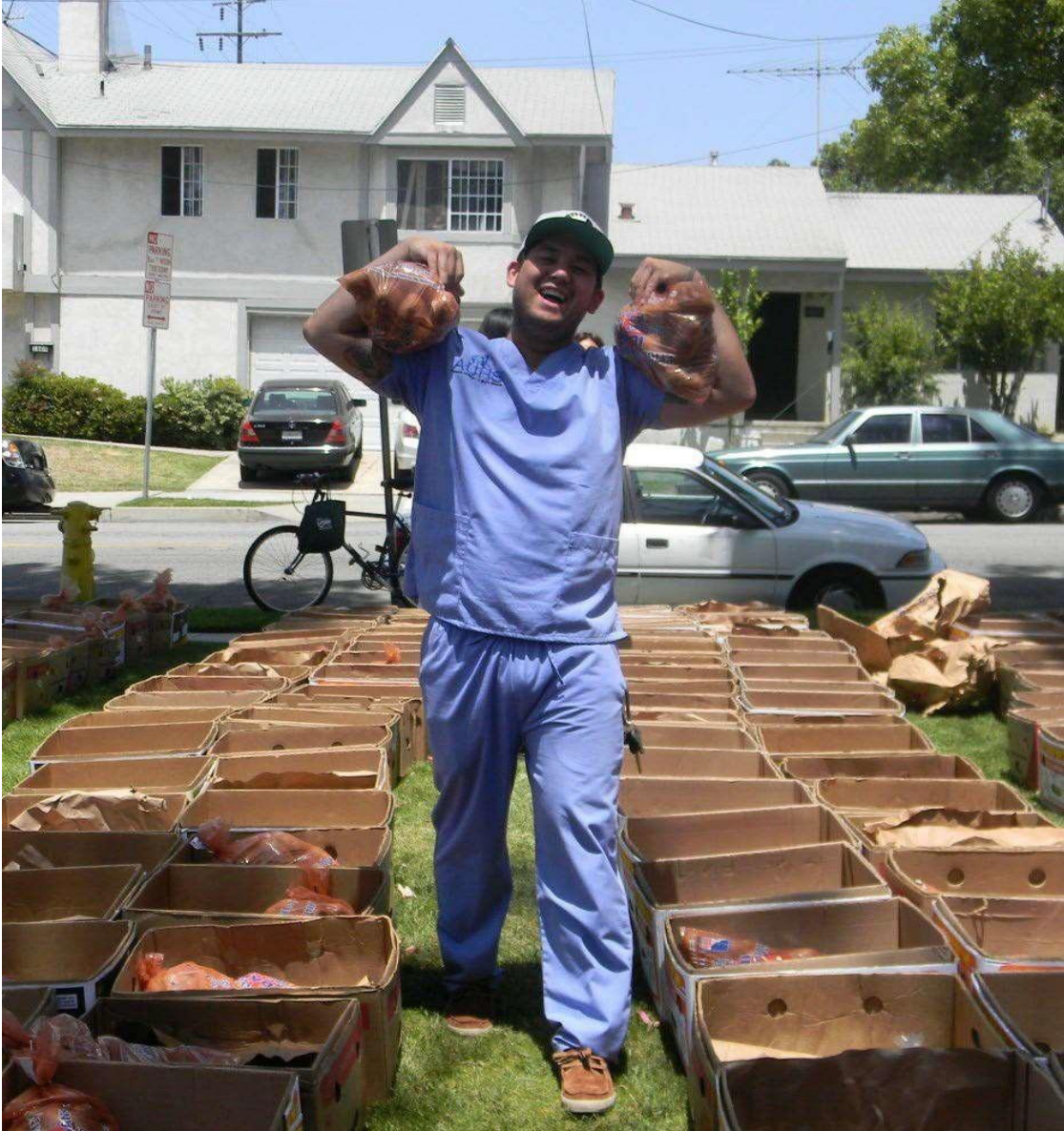
Annual Thanksgiving Food Drive