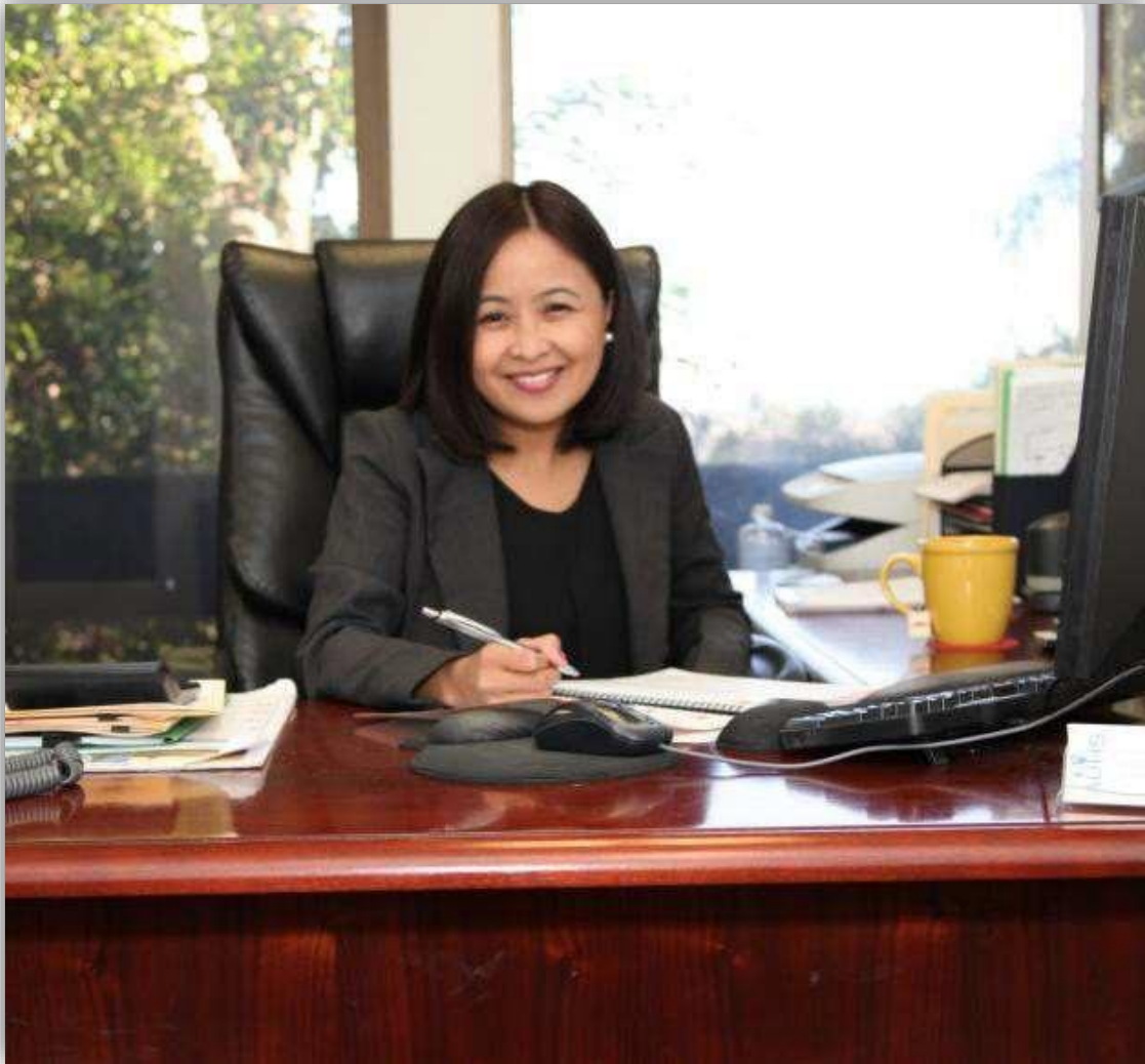
Office of the Student Services