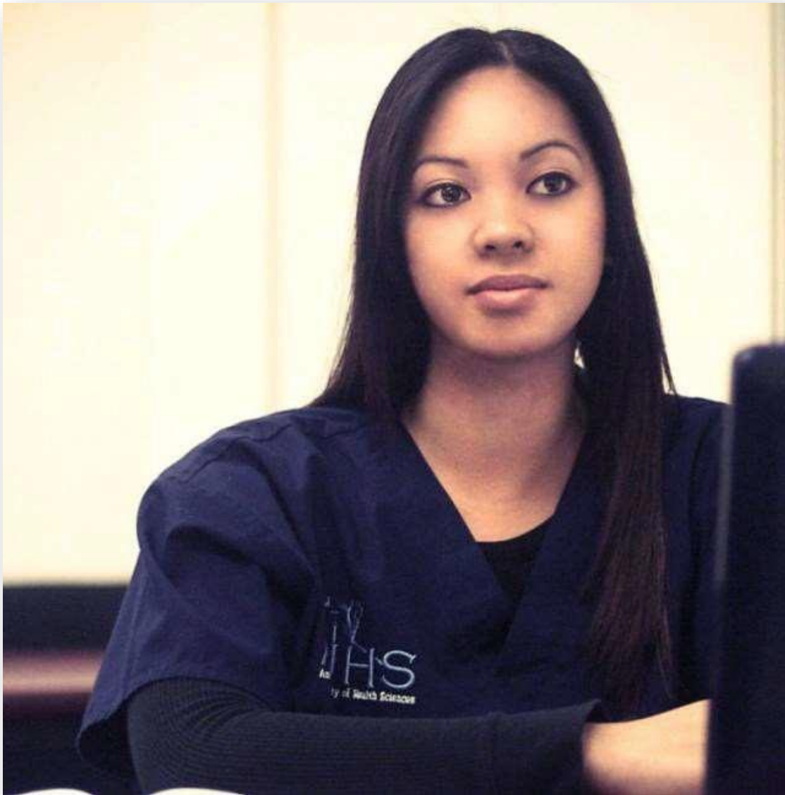
Student, School of Nursing during lecture

“I pray that out of his glorious riches he may strengthen you with power through his Spirit in your inner being, so that Christ may dwell in your hearts through faith. And I pray that you, being rooted and established in love, may have power, together with all the Lord’s holy people, to grasp how wide and long and high and deep is the love of Christ, and to know this love that surpasses knowledge—that you may be filled to the measure of all the fullness of God.” ~Ephesians 3:16-19