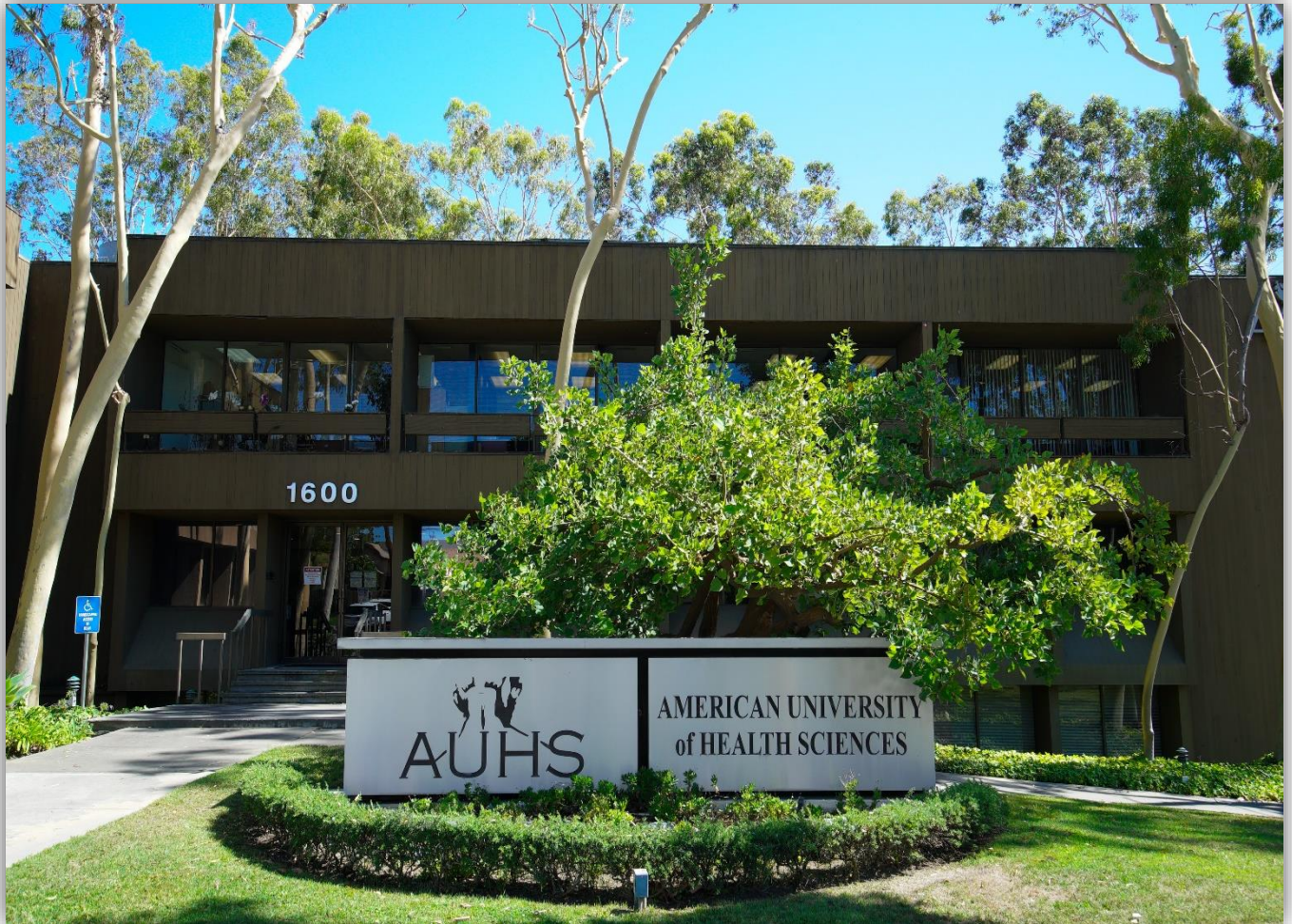
Front, American University of Health Sciences

“How blessed is the man who does not walk in the counsel of the wicked, nor stand in the path of sinners, nor sit in the seat of scoffers! But his delight is in the law of the LORD, and His law he meditates day and night. He will be like a tree firmly planted by streams of water, which yields its fruit in its season and its leaf does not wither; and in whatever he does, he prospers.” - Psalm 1:1-3