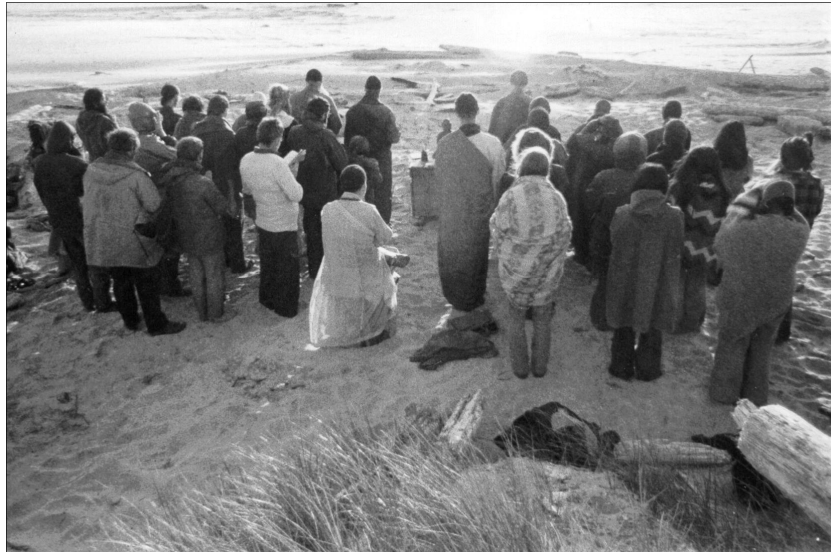
Culminating a Buddha-recitation session at Buddha Root Farm in Oregon, the Master and participants perform the Great Transference of merit on the shores of the Pacific at Sunset.