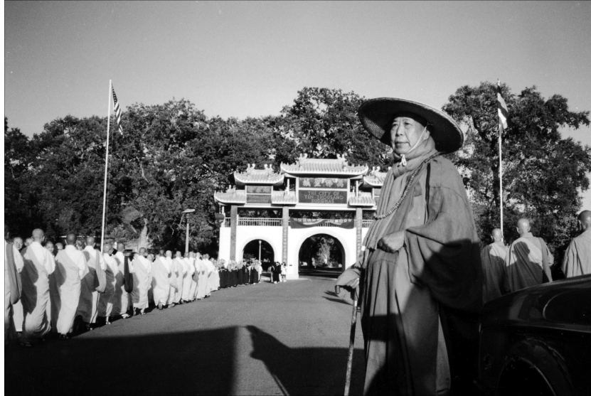
The Venerable Master presiding at Full Ordination Ceremonies.

the Sixth Patriarch's Sutra , the Buddha Speaks of Amitabha Sutra , the Sutra in Forty-Two Sections , both National Master Ch'ing Liang's Preface and Prologue , and the Chapter on the Conduct and Vows of Universal Worthy Bodhisatva from the Avatamsaka Sutra , as well as the Hundred Dharmas Shastra , and Shastra on the Awakening of Faith , and the Shramanera Vinaya .