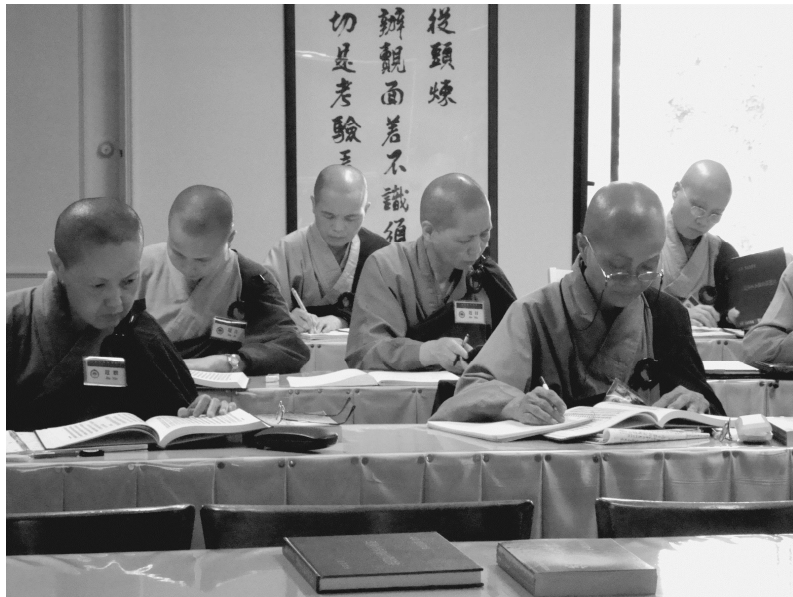
Sangha students studying and memorizing Vinaya texts.

The classroom instructor monitors the students' progress by observation of attendance, attentiveness, participation in the class format, and completion of assignments. A letter grade is assigned, indicating comprehension of the content covered in the class. Clock hours are earned as recorded on attendance records. Trainees who wish to take Dharma Realm Buddhist University classes for clock-hour and letter-grade credit in the Sangha or Laity Training Program, must complete a Special Studies Form, get the instructor's signature and then pass the form to the Registrar's Office.