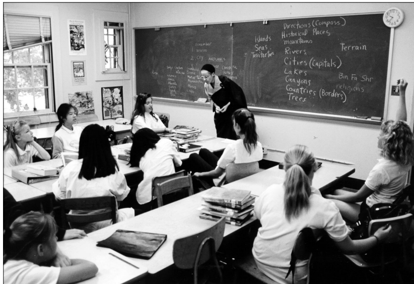
Developing Virtue Girls' School students during an in-class discussion led by an ordained nun.

Instilling Goodness Elementary School and Developing Virtue Secondary School, have been operating at the City of Ten Thousand Buddhas since 1973 and 1976 respectively. The Association also sponsors intensive retreats and meditation sessions; daily lectures on the Buddhist Sutras; and, periodic ordinations of Bhikshus and Bhikshunis (monks and nuns) into the orthodox Buddhist Sangha. The Association publishes the Buddhist monthly journal, Vajra Bodhi Sea.