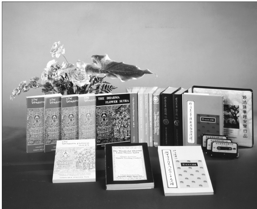
Books and Audio Tapes Published by the Buddhist Text Translation Society.

Recommended Readings: To be arranged by instructor.