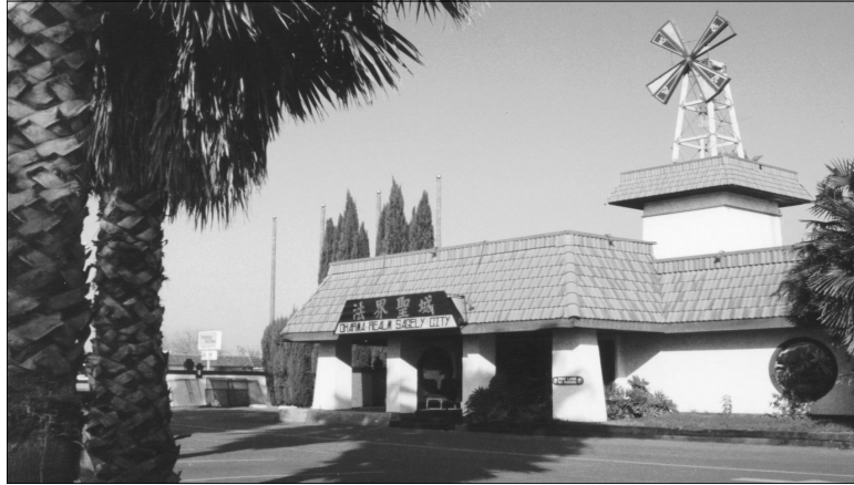
Entrance to the worship hall, City of the Dharma Realm, West Sacramento.