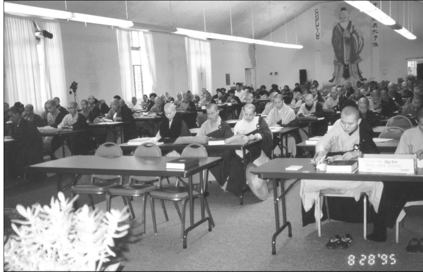
Vinaya class being held in the Dao Yuan (Source of the Way) Hall, City of Ten Thousand Buddhas.

This area provides qualified students in their fourth year of study the opportunity to apprentice in diverse aspects of monastic administration and community service. This may include classroom teaching-assistant training; learning to make curriculum aids and teaching materials; training in the management of worship halls, dormitories, libraries, and religious centers, such as temples, translation institutes, educational facilities, and retreat locations; greeting, providing for, and handling matters for guests; directing reception centers, and administering delegations and special events; counseling elementary and high school students; and offering programs that provide companionship, physical care, and moral support for the elderly. Students are assigned counselors, and each student conducts his or her training under the supervision of at least one certified instructor. Students may choose to conduct their apprenticeship on campus, or at a DRBA-authorized religious center.