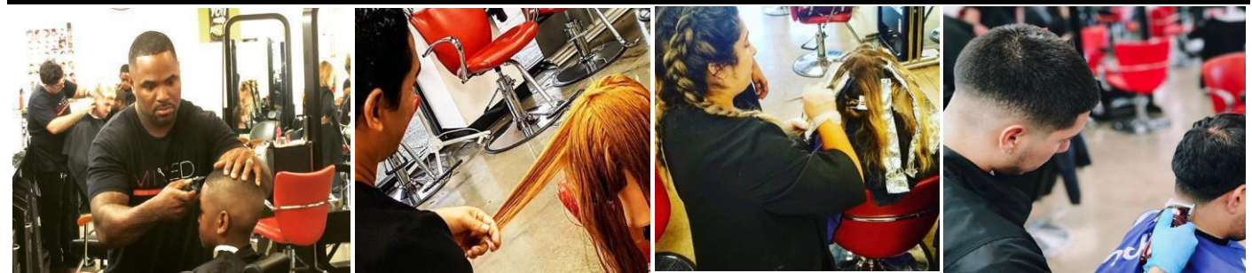
Valid from 01/01/2022 through 01/01/2023

5950 Florin Rd. Suite 103 | Sacramento Ca. 95823 | Main Line (916) 421-5950 Enrollment (916) 389-8903 | Fax (916) 303-8593 WWW.MIX-ED.COM | Email: Info@mixed.institute