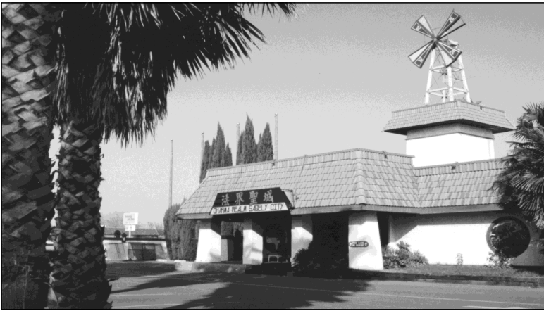
Entrance to the worship hall, City of the Dharma Realm, West Sacramento.