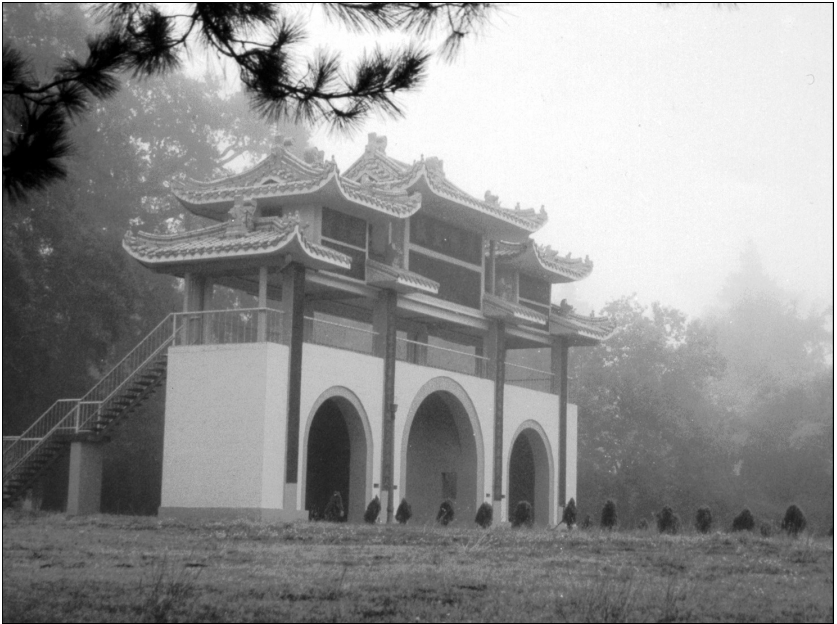
Entrance to the City of Ten Thousand Buddhas.