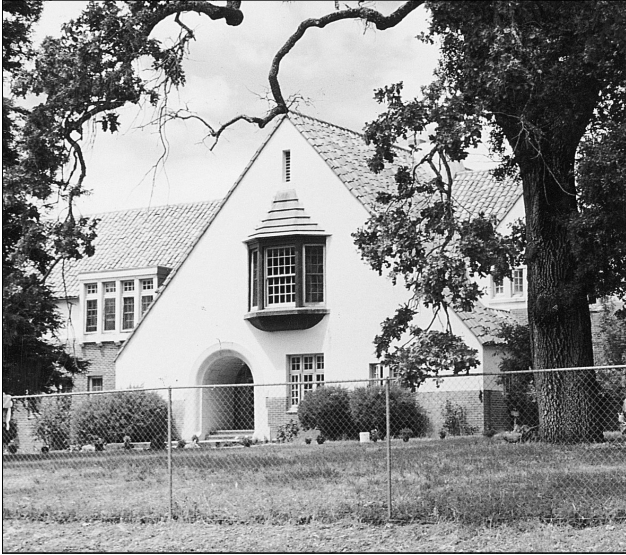
The City of Ten Thousand Buddha’s permanent precept platform is housed in Wisdom Hall.

Beginning: Elementary Sanskrit. Recognition of Devanagari and fundamental principles of grammar. Intermediate: Use of dictionaries. Principles of grammar. Readings. Advanced: Reading of selected Sanskrit texts.