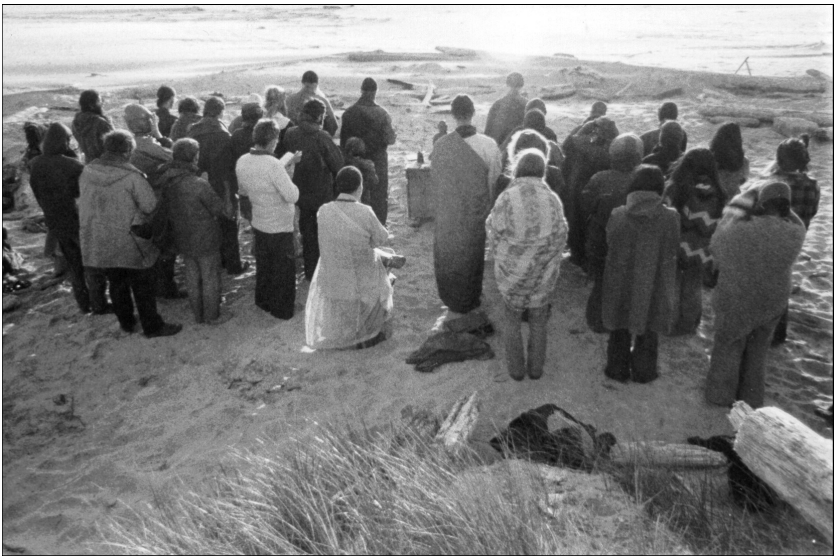
Culminating a Buddha-recitation session at Buddha Root Farm in Oregon, the Master and participants perform the Great Transference of merit on the shores of the Pacific at Sunset.

In June, 1995, not having paused to rest his entire life, the Venerable Master Hua entered Nirvana.