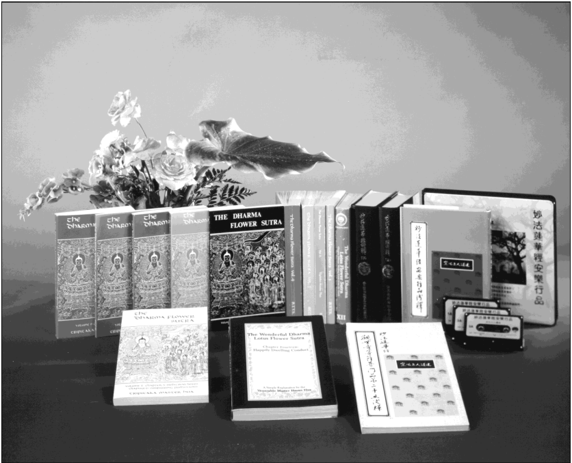
Books and Audio Tapes Published by the Buddhist Text Translation Society.

Recommended Readings: To be arranged by instructor.