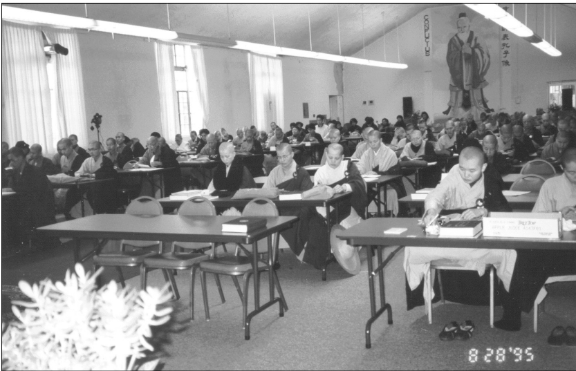
Vinaya class being held in the Dao Yuan (Source of the Way) Hall, City of Ten Thousand Buddhas.

This area provides qualified students in their fourth year of study the opportunity to apprentice in diverse aspects of monastic administration and community service. This may include classroom teaching-assistant training; learning to make curriculum aids and teaching materials; training in the management of worship halls, dormitories, libraries, and religious centers, such as temples, translation institutes, educational facilities, and retreat locations; greeting, providing for, and handling matters for guests; directing reception centers, and administering delegations and special events; counseling elementary and high school students; and offering programs that provide companionship, physical care, and moral support for the elderly. Students are assigned counselors, and each student conducts his or her training under the supervision of at least one certified instructor. Students may choose to conduct their apprenticeship on campus, or at a DRBA-authorized religious center.