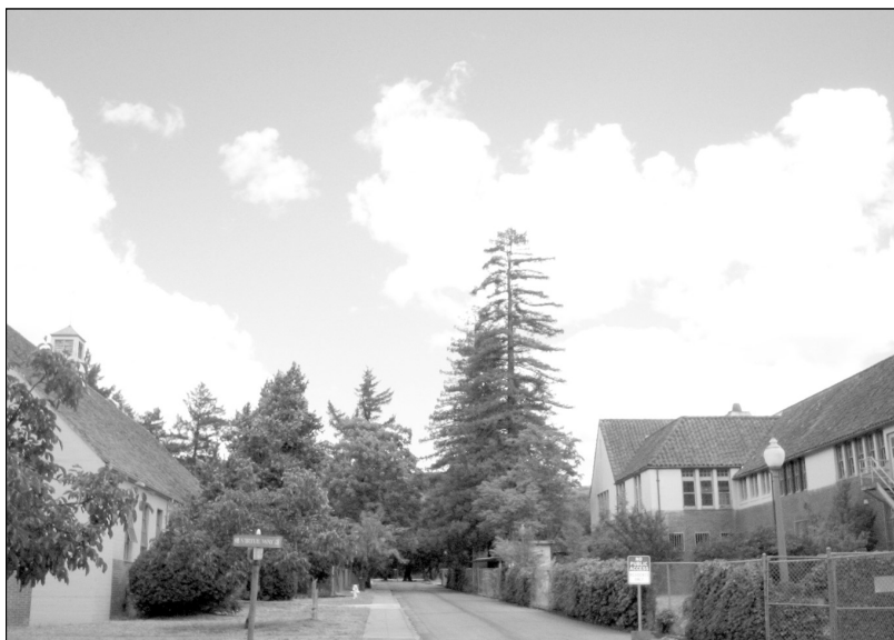
View of Wordless Hall and road towards Wonderful Enlightened Mountain.