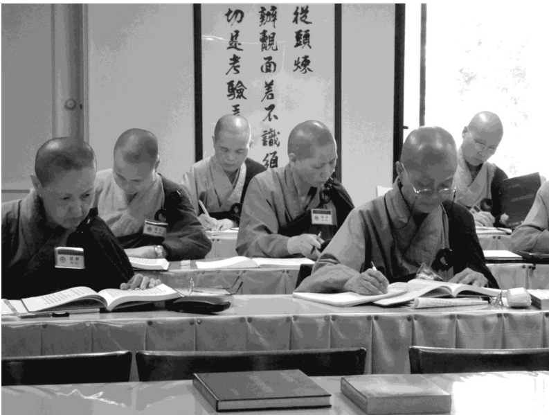
Sangha students studying and memorizing Vinaya texts.

The classroom instructor monitors the students' progress by observation of attendance, attentiveness, participation in the class format, and completion of assignments. A letter grade is assigned, indicating comprehension of the content covered in the class. Clock hours are earned as recorded on attendance records. Trainees who wish to take Dharma Realm Buddhist University classes for clock-hour and letter-grade credit in the Sangha or Laity Training Program, must complete a Special Studies Form, get the instructor's signature and then pass the form to the Registrar's Office.