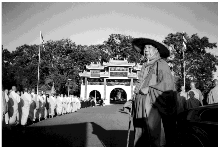
The Venerable Master presiding at Full Ordination Ceremonies.

the Sixth Patriarch's Sutra , the Buddha Speaks of Amitabha Sutra , the Sutra in Forty-Two Sections , both National Master Ch'ing Liang's Preface and Prologue , and the Chapter on the Conduct and Vows of Universal Worthy Bodhisattva from the Avatamsaka Sutra , as well as the Hundred Dharmas Shastra , and Shastra on the Awakening of Faith , and the Shramanera Vinaya .