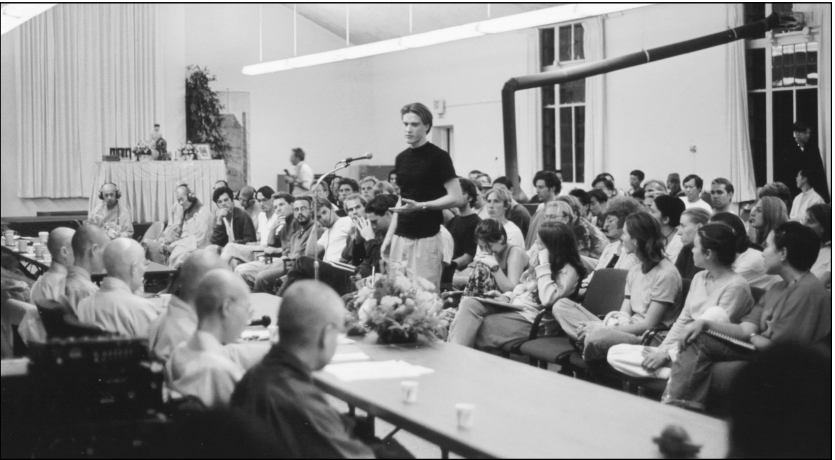
Visiting students direct questions to a panel of monks and nuns during a weekend retreat.