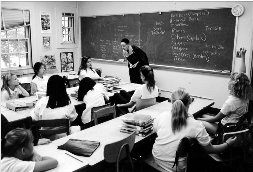
Developing Virtue Girls' School students during an in-class discussion led by an ordained nun.

Instilling Goodness Elementary School and Developing Virtue Secondary School, have been operating at the City of Ten Thousand Buddhas since 1973 and 1976 respectively. The Association also sponsors intensive retreats and meditation sessions; daily lectures on the Buddhist Sutras; and, periodic ordinations of Bhikshus and Bhikshunis (monks and nuns) into the orthodox Buddhist Sangha. The Association publishes the Buddhist monthly journal, Vajra Bodhi Sea.