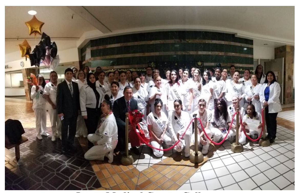
Lotus Medical Career College

1460 E. Holt Avenue Suite 176A Pomona, CA 91767 (909) 625-8050 FAX (909) 625-8050 <a href="http://lmccpomona/gix.net">http://lmccpomona/gix.net</a>