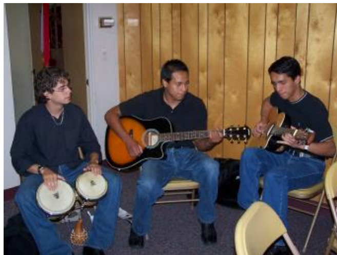
Final Presentation for Humanities 110