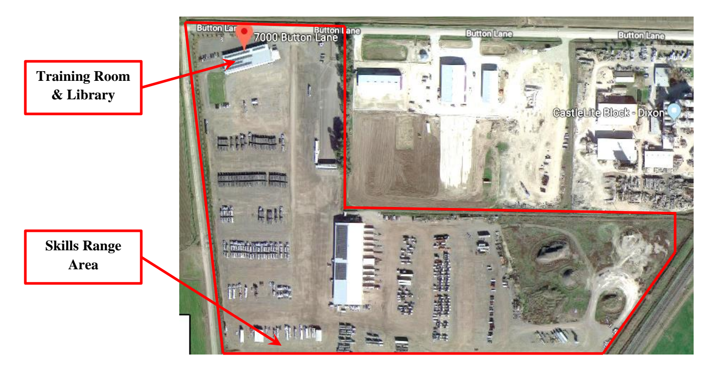
AAA Academy Facility within

Button Transportation/Benjamin's Transfer Yard