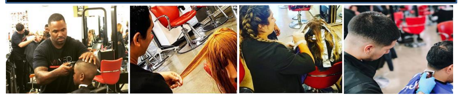
Revised 08/01/2023. Valid from 01/01/2023 through 12/31/2023

5950 Florin Rd. Suite 103 | Sacramento Ca. 95823 | Main Line (916) 421-5950 Enrollment (916) 389-8903 | Fax (916) 303-8593 WWW.MIX-ED.COM | Email: Info@mixed.institute